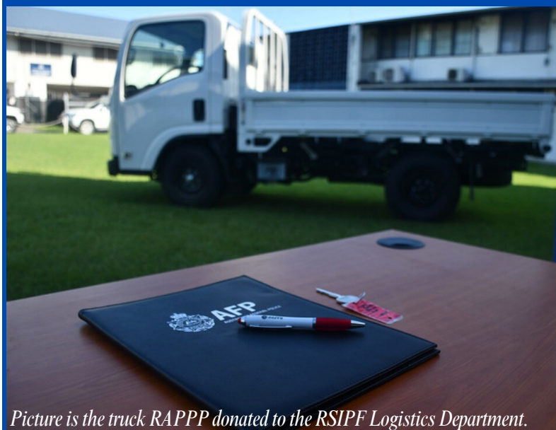
Picture is the truck RAPPP donated to the RSIPF Logistics Department.

In June, RAPPP donated a two-and-a-half tonne truck to the RSIPF's Logistics Department.