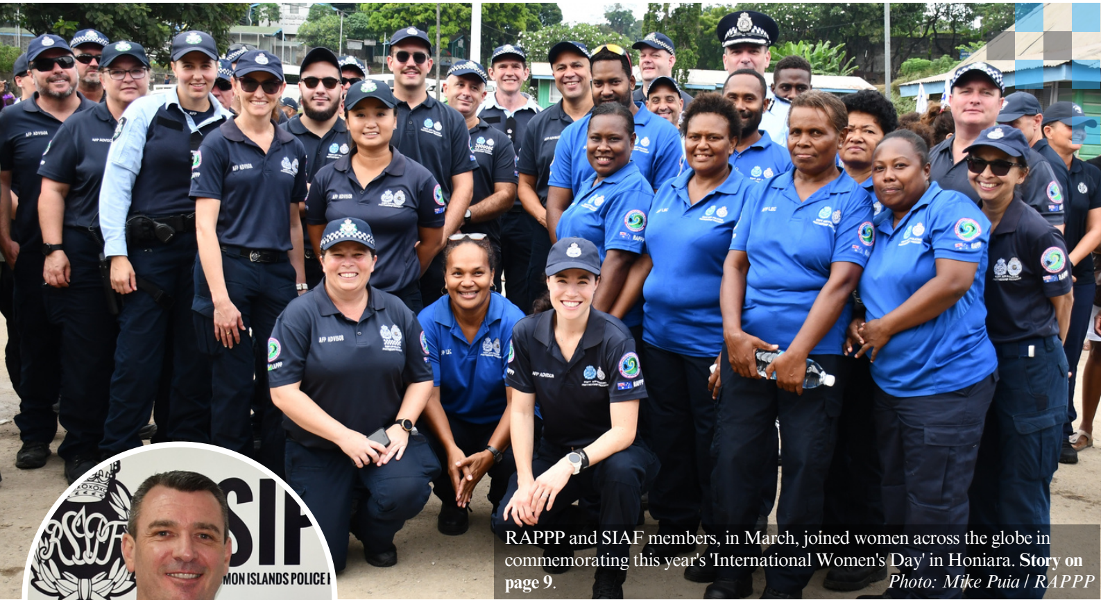
RAPP and SIAF members, in March, joined women across the globe in commemorating this year's 'International Women's Day' in Honiara. Story on page 9.