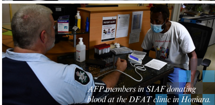
AFP members in SIAP donating blood at the DFAT clinic in Honiara.