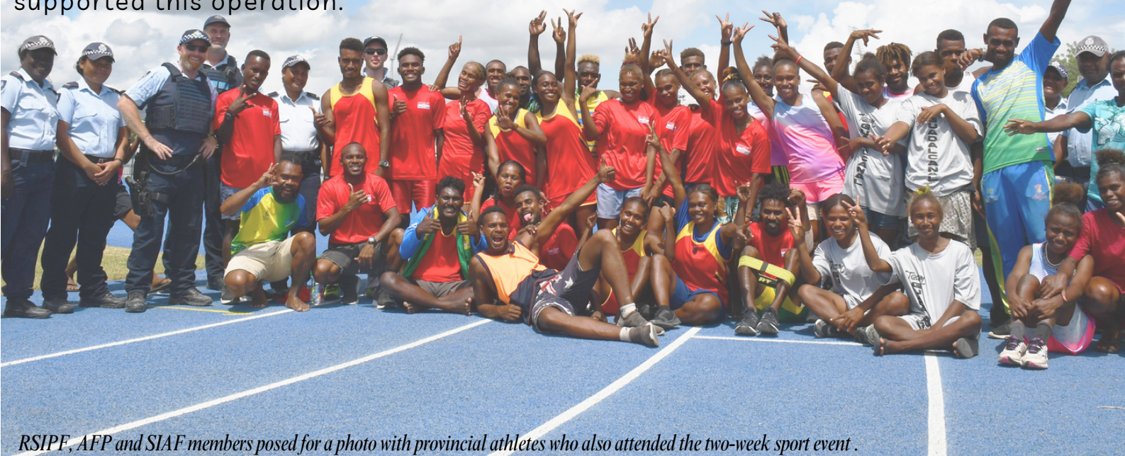
RSIPF, AFP and SIAF members posed for a photo with provincial athletes who also attended the two-week sport event.