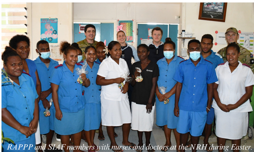
RAPPP and SIAF members with nurses and doctors at the NRH during Easter.

He said the AFP and its joint security partners are committed to supporting the Solomon Islands in all facets of the community including policing, healthcare, infrastructure and education.