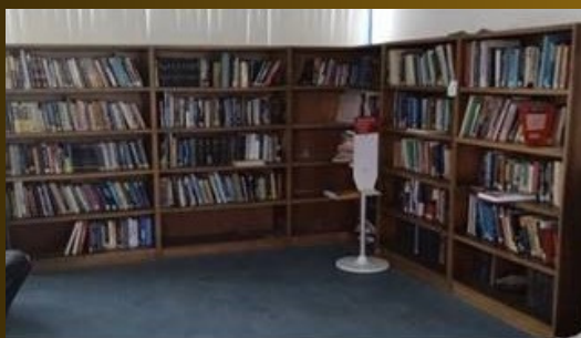
RSIPF Library at Rove Police Headquarters

These books and journals are intended to help RSIPF officers with their assignments and research and offer resources to help RSIPF officers increase their knowledge.