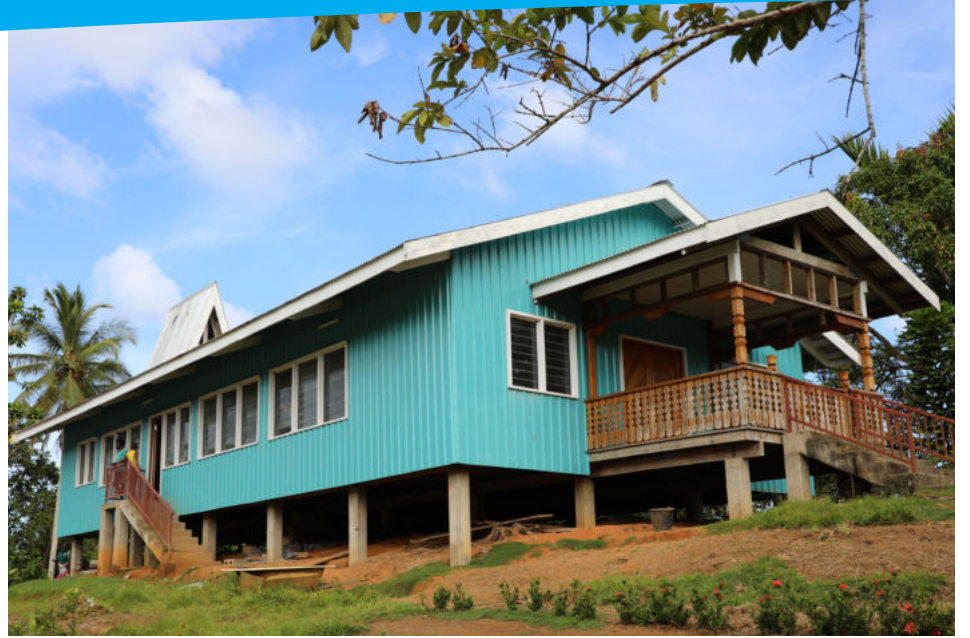
United Church building at Kio Community in East Choiseul Constituency. This CDF project is implemented through community partnership with the constituency office.