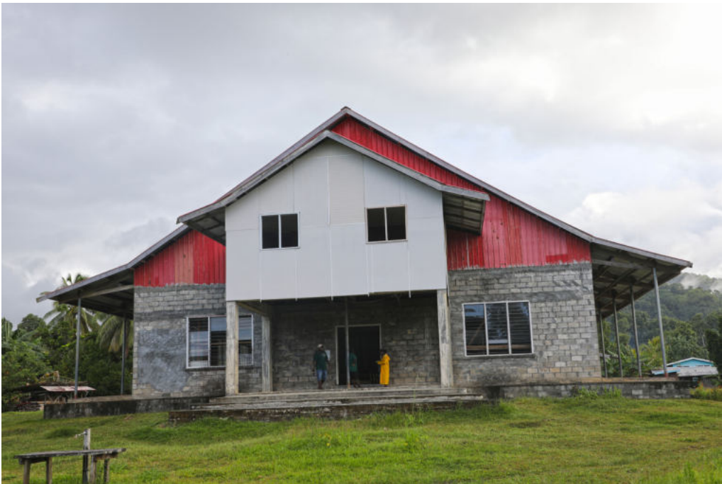
Buruku SDA church co-funded by CDF through the provision of building materials. The church is now nearing completion.

Headmistress of Vancouver Secondary school Mavis Bero Etupioh also shared the same sentiments.