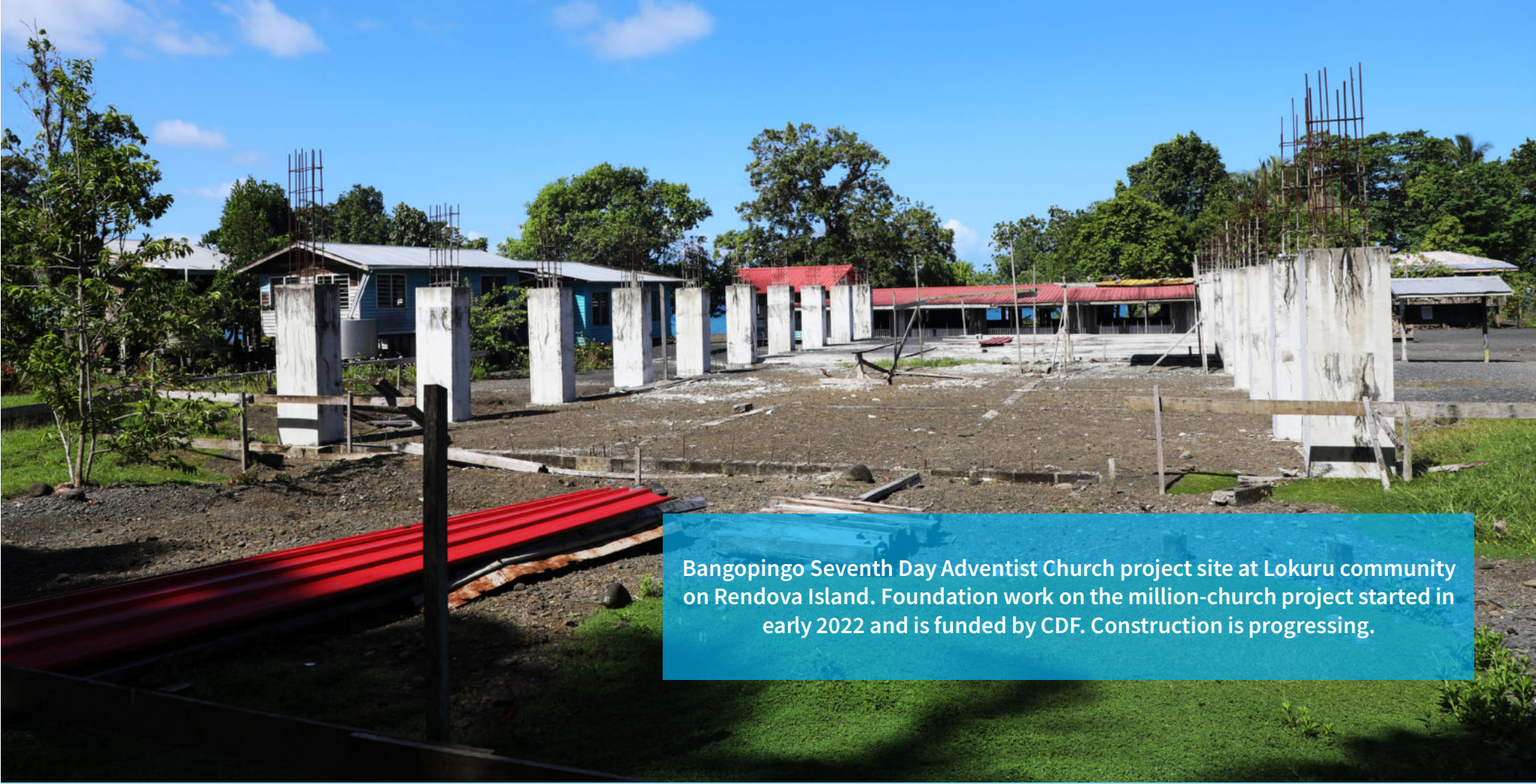
Bangopingo Seventh Day Adventist Church project site at Lokuru community on Rendova Island. Foundation work on the million-church project started in early 2022 and is funded by CDF. Construction is progressing.

The Ministry of Rural Development (MRD) Monitoring and Evaluation (M&E) team has conducted an assessment on the Constituency Development Fund (CDF) funded projects within South New Georgia (Rendova/Tetepare) Constituency.