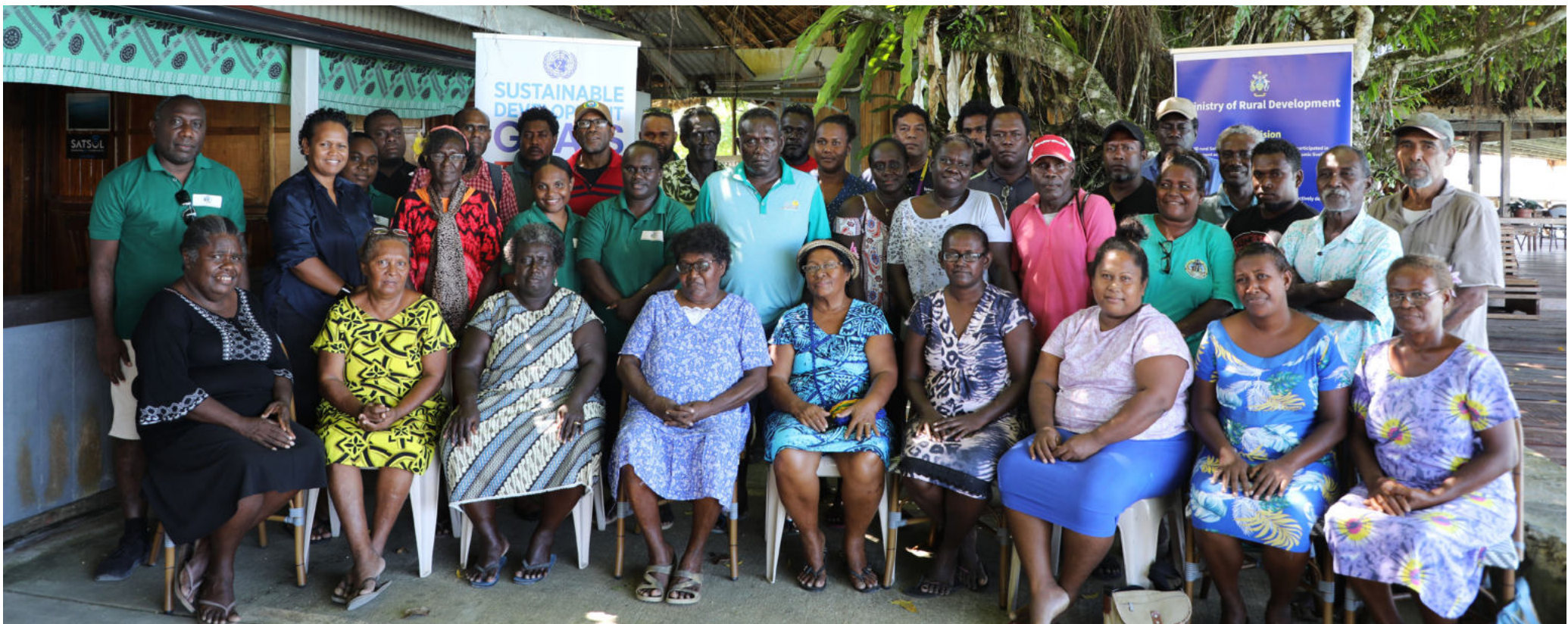
Government officials and participants who attended the consultation in Munda, Western Province.