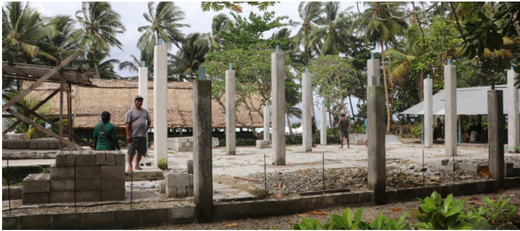
Infrastructure Project- Geta village church building recipient of building materials under CDF fund, EMC. Work on the project is progressing.