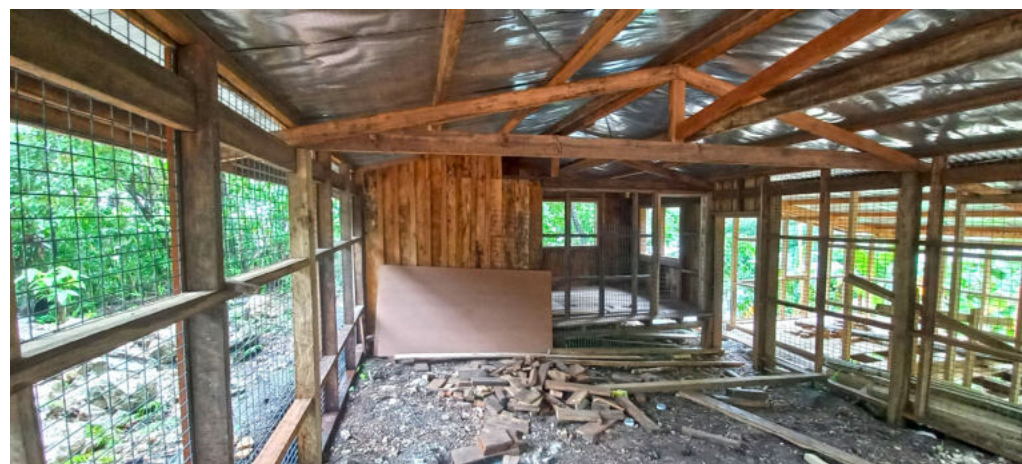
Part of the poultry project house from inside that is under construction. Construction work is progressing.