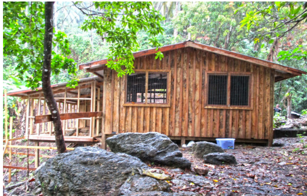
The poultry project house funded by CDF. This photo was taken on August 2022 when a team from the Ministry of Rural Development (MRD) conducted a monitoring activity on CDF funded projects in the constituency.

MRD is fully committed to see that all rural Solomon Islanders become meaningfully participated in development activities to improve their social and economic livelihoods.