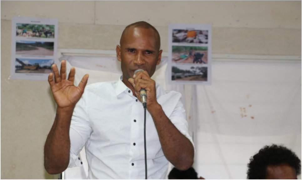
A participant from West Kwaio making his contribution during the open discussion session.