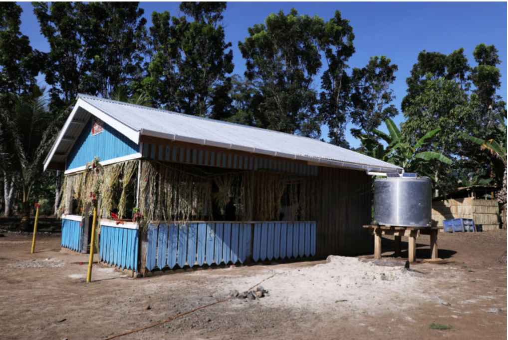
The Koloteve market house project funded by CDF.