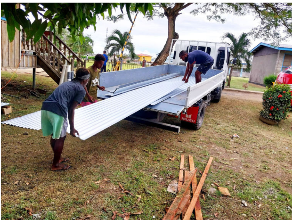
Central Honiara Constituency team delivering the materials at the project site.