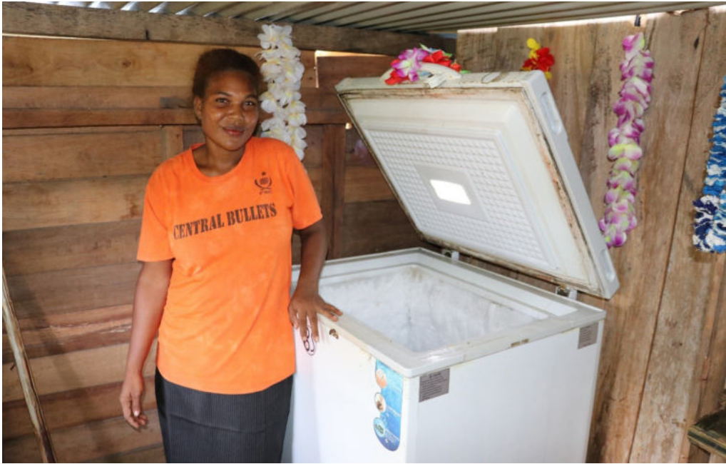
A beneficiary of Income generating project with her solar deep freezer supporting her rest house in Aorigi.