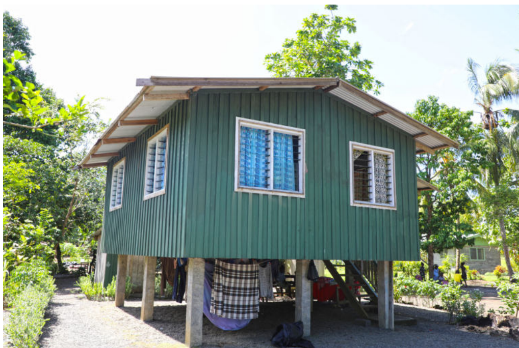
One of the three staff houses that is funded by CDF with community support.