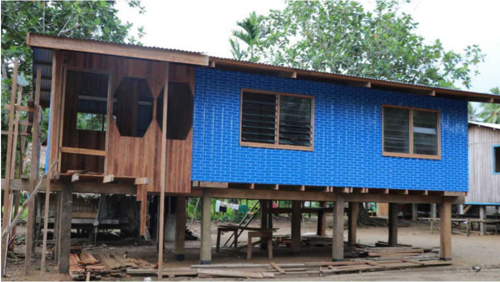
Housing scheme project in EMC. This is just one of the houses in Parego village funded under CDF fund. Work on the project is progressing.