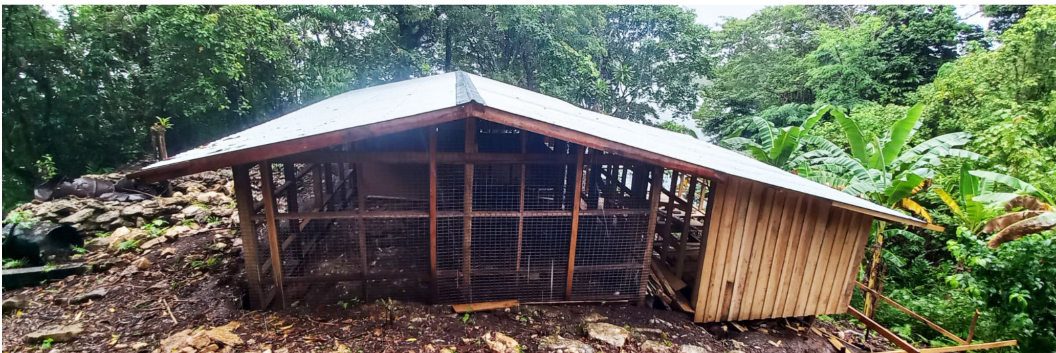
Work progress on the project as of August 2022. Work is progressing and now into its completion stages.