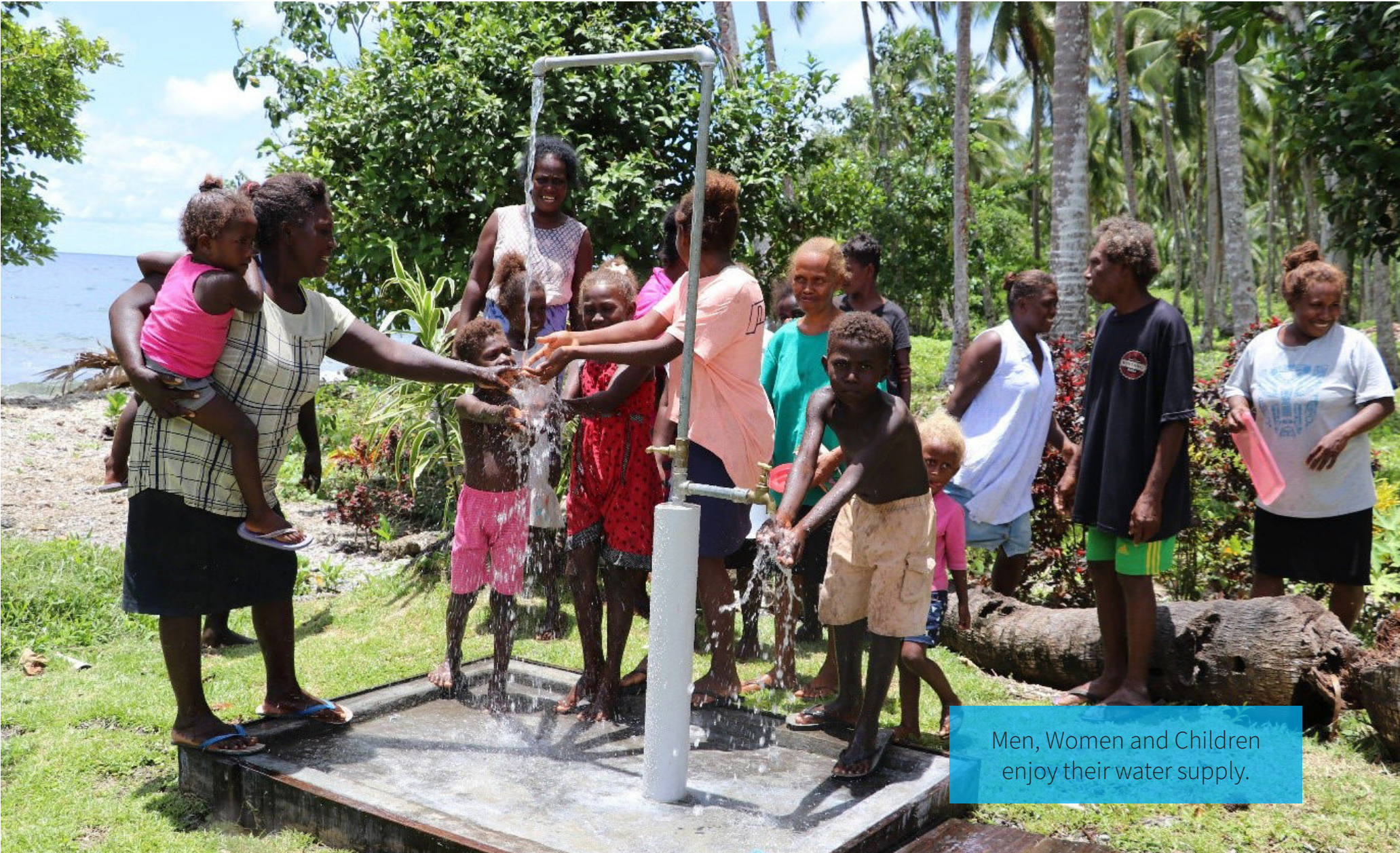
Men, Women and Children enjoy their water supply.

“Everyone in the community had a role to play and to keep the project on track,” he added. The Sausepe Water Supply Project was funded under the Constituency Development Fund (CDO). The water supply project also boosts water and sanitation development in Sasepe and the surrounding communities including Sausepe primary school. The project was successfully completed last year. MRD Monitoring and Evaluation Team successfully since Wednesday completed Kolombangara yesterday and will tour Gizo communities today and Saturday. MRD vision is to ensure all rural Solomon Islands become meaningfully participated in development activities to improve their social and economic livelihood.