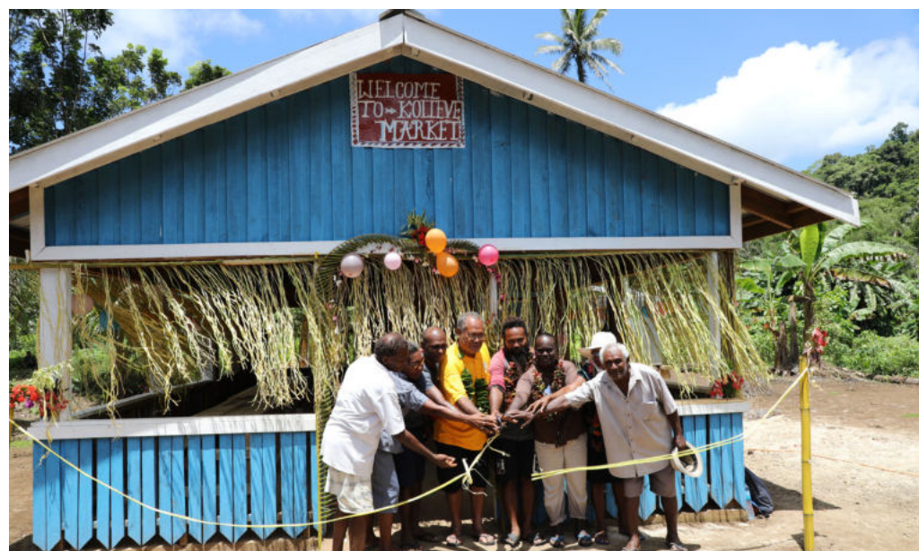
Hon. Minister and MP for GBC together with MRD officials and community chiefs and reps cutting the ribbon to official open the market house project.