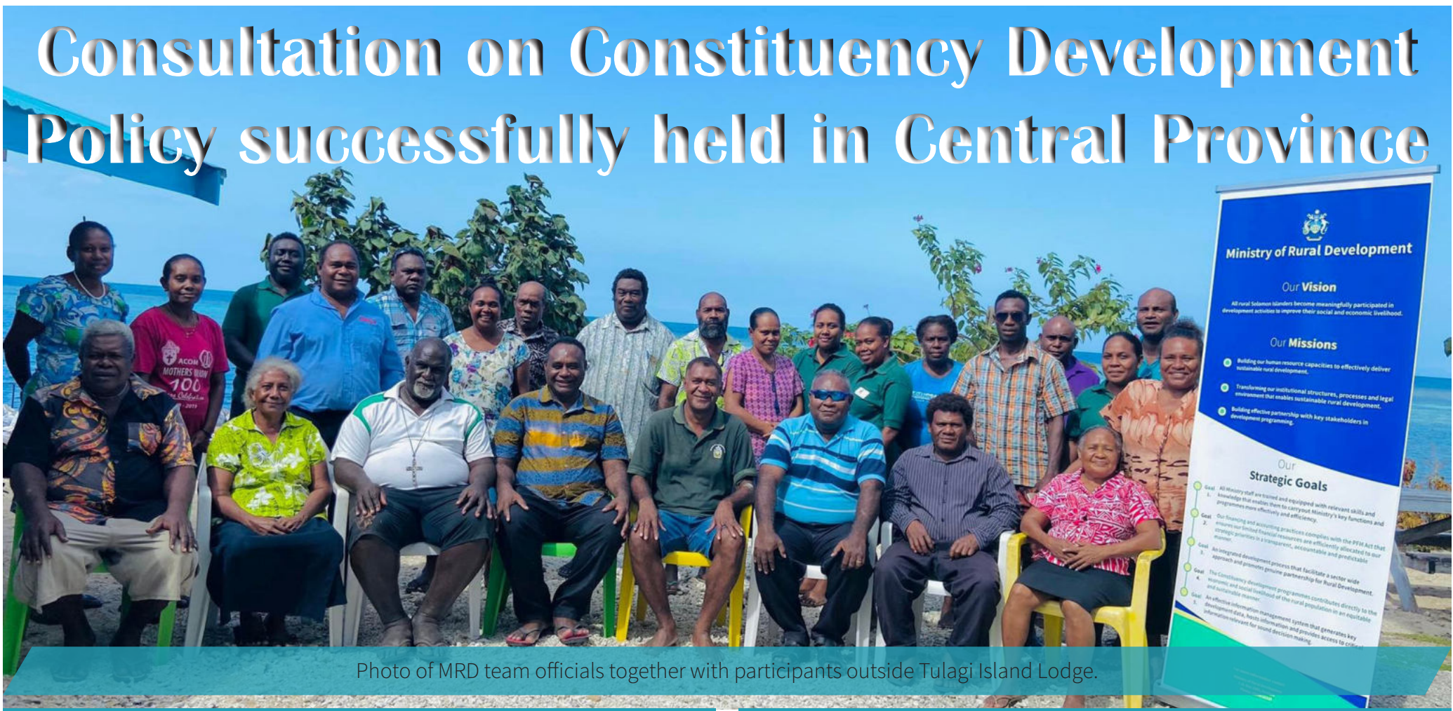
Photo of MRD team officials together with participants outside Tulagi Island Lodge.

A five- member team from the Ministry of Rural Development (MRD) has successfully conducted two-days consultations on the first ever Solomon Islands Constituency Development (SICD) Policy concept, at the Tulagi Island Lodge in Central Province (CIP) from 6th – 7th September, 2022.