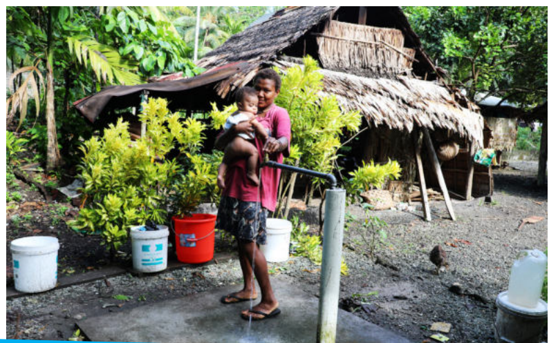
Water project in Temotu Pele Constituency funded by CDF.