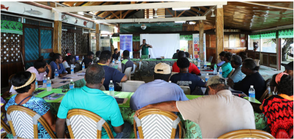
Above and below are photos of the consultation held at Munda, Western.

“This policy framework overall intends to guide the management