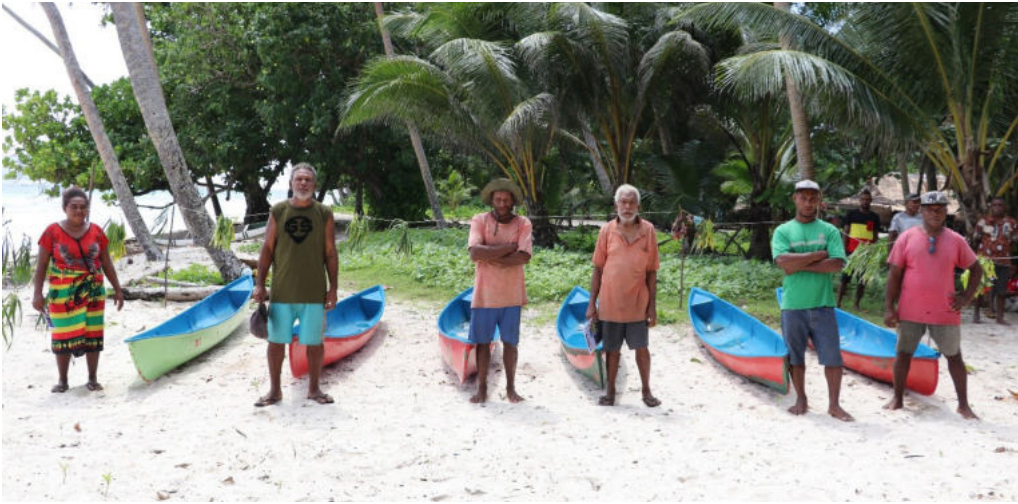
Fishery Income generating project- few recipients of fiberglass canoes funded under CDF in Aorigi, EMC.

“I would like to acknowledge community leaders, elders, chiefs, church leaders, women leaders and individuals from villages and communities that we have visited during the monitoring task for their assistance and working together which resulted in the success of the activity.