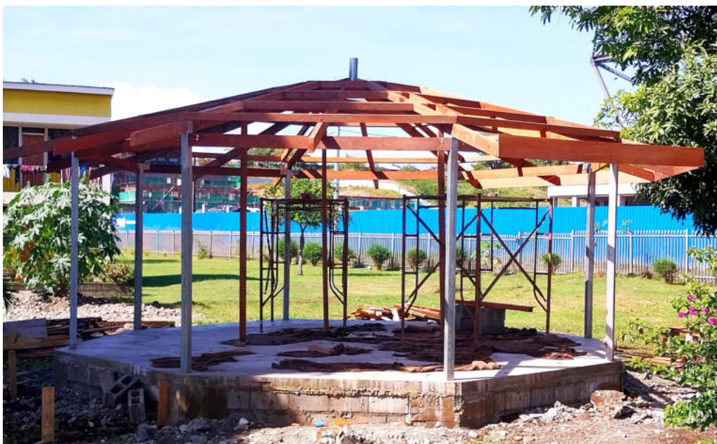
The new study hut project taking shape.