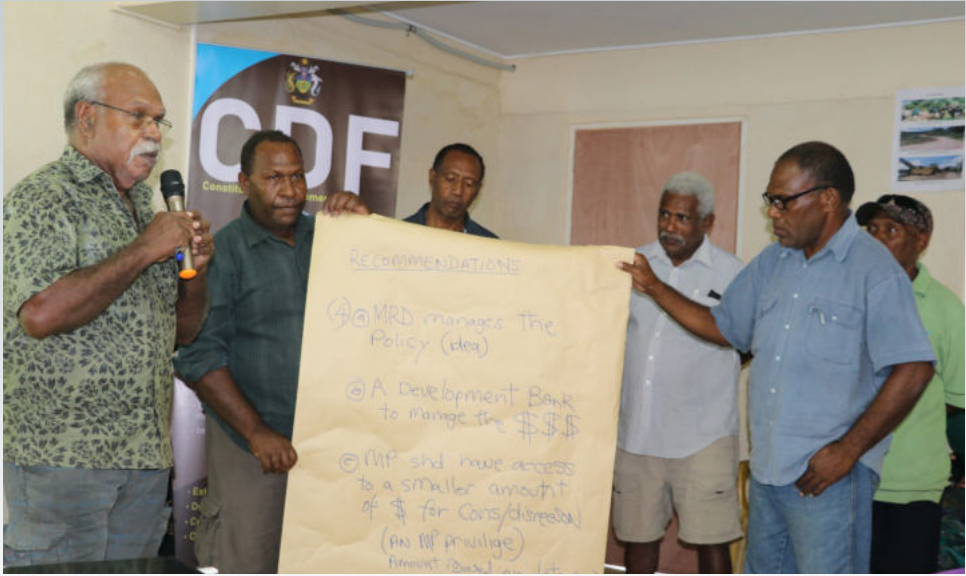
Participants presents their recommendations during group presentation session.

He reiterated that this policy framework overall intends is to guide the management and enhance the delivery of the Constituency Development Funds.