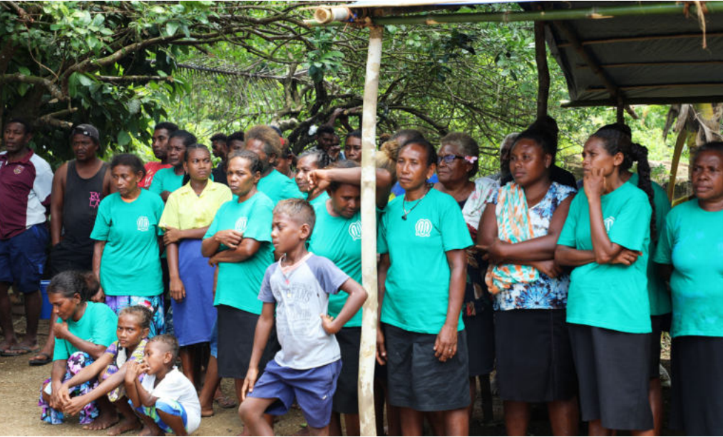
Some of the women of Tanade community who attended the handing over program.

“Now that we have this market centre, we do not have to worry any more to travel to Tataba which would be now a thing of the past. This is a tremendous gift so thank you government,” she expressed.