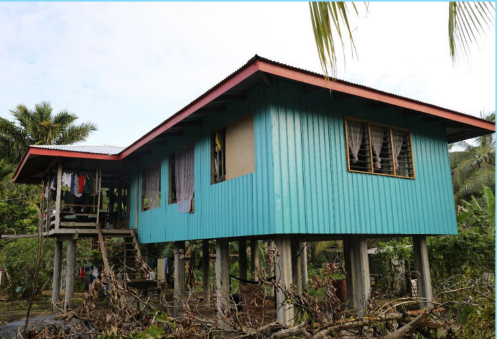
One of the houses funded by CDF at Ughele community. Work on the project is ongoing.

Danny Philip is the current Member of Parliament for South New Georgia Constituency.