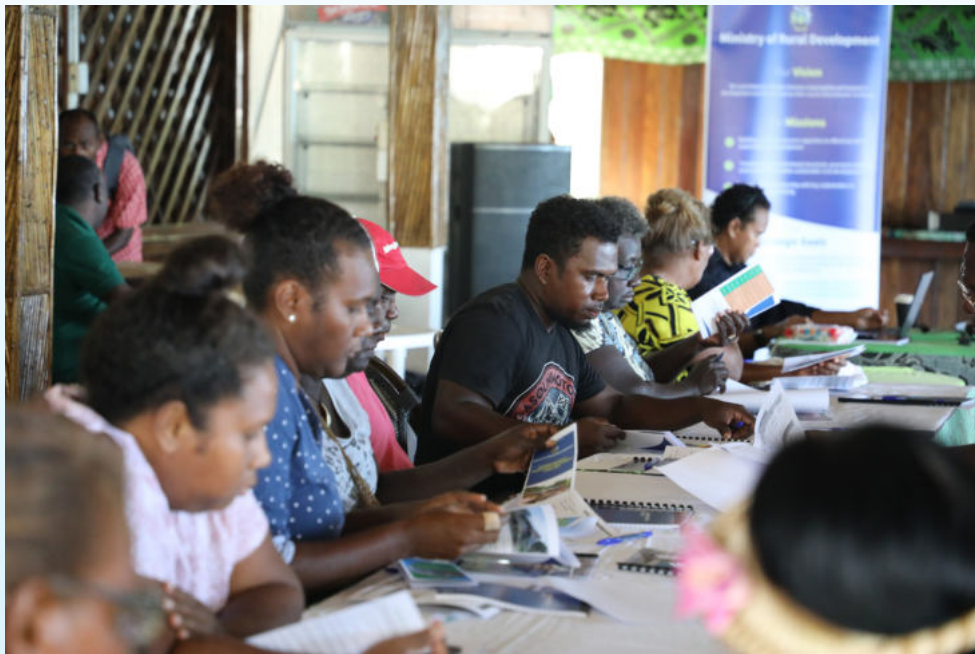
Participants who attended the consultation in Munda, Western Province.