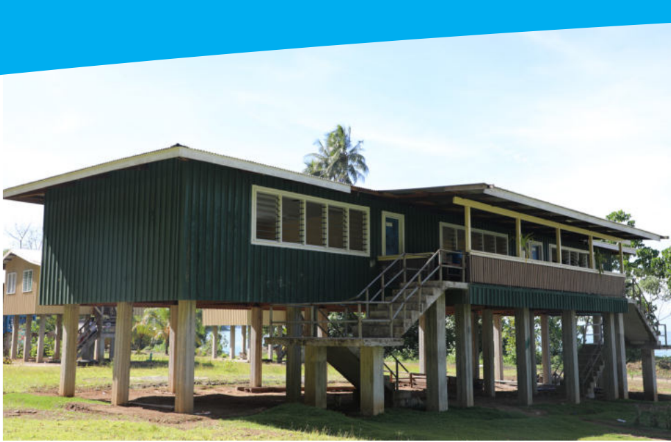
A permanent classroom at Soranamola community high school in East Choiseul Constituency. This CDF project is implemented by Soranamola in partnership with the constituency office.