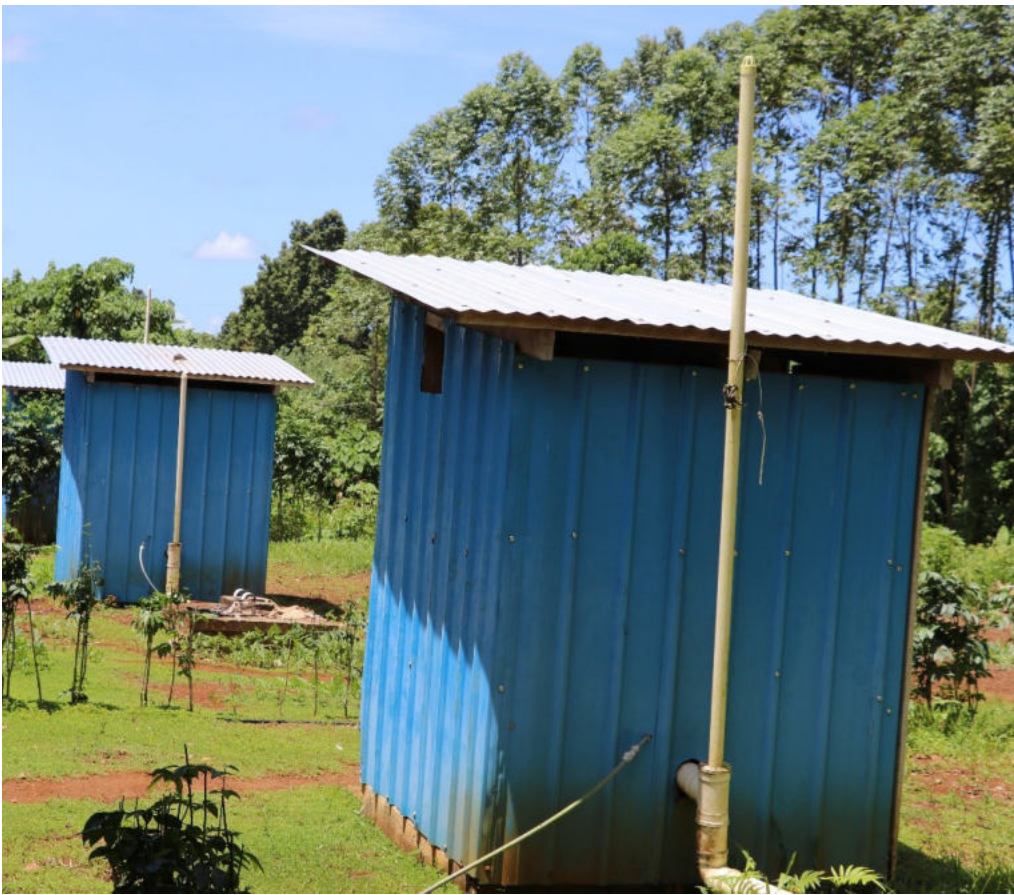
New Water supply project boost school sanitation Vao-Sausepe Primary School, Ward 12, Gizo/Kolombagara Constituency.