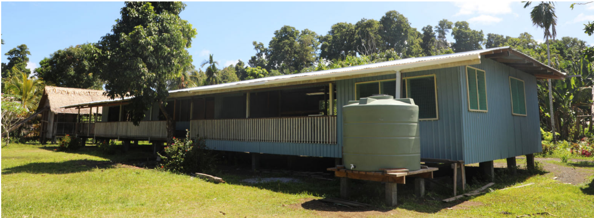
Vancouver new primary classroom that is co-funded by CDF through the provision of building materials. The project commenced in 2021 and construction work is progressing.