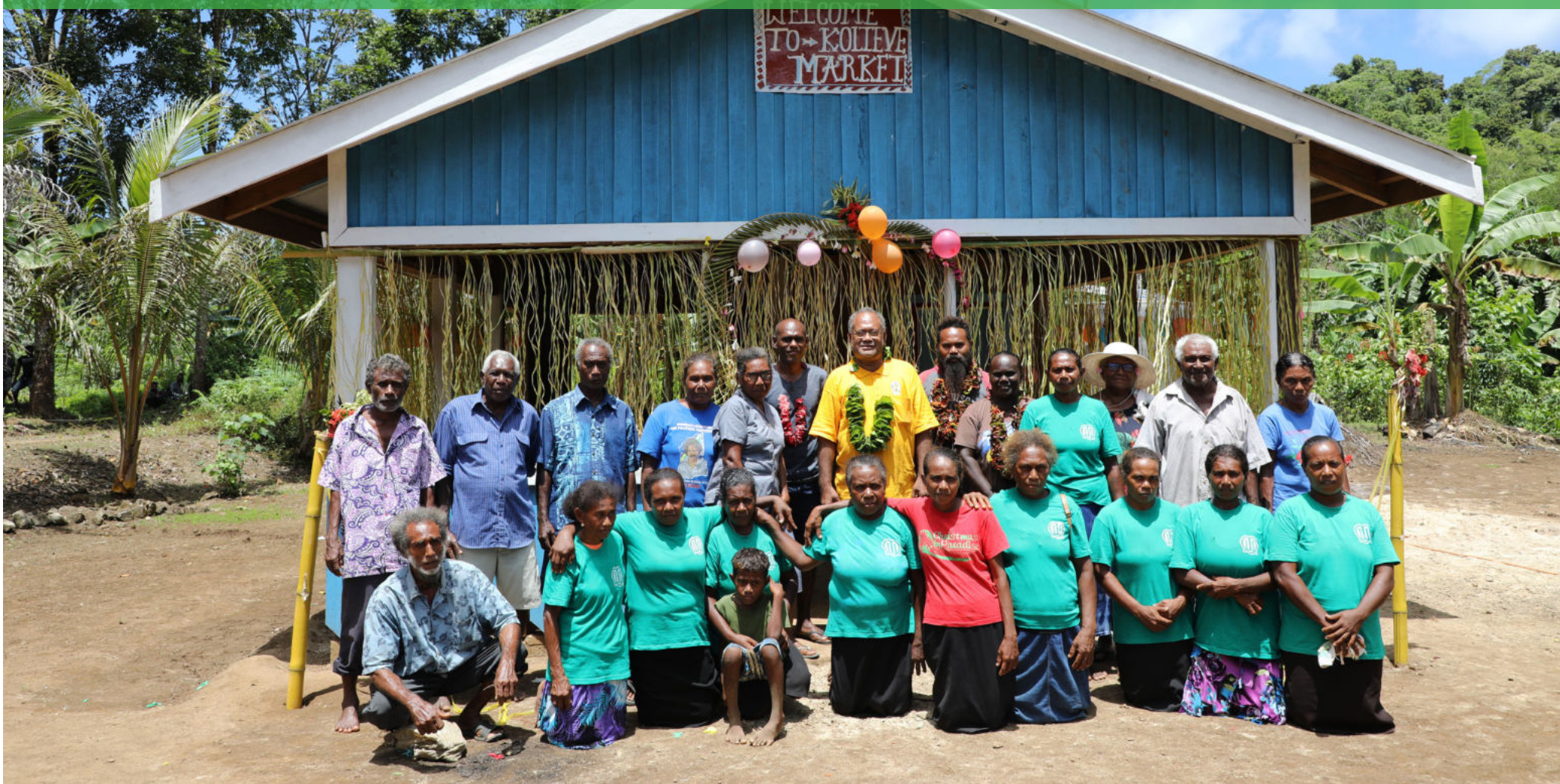
Minister and MP for Gao-Bugotu, MRD officers together with some of the Tanade mothers Unit women and community chiefs.

Women of Tanade community has expressed their profound gratitude to the government through their Member of Parliament (MP) Honourable Samuel Manetoali for supporting them with a new Market House Centre.