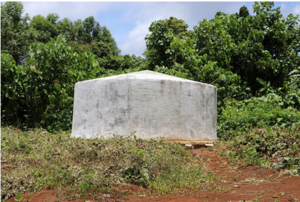
The supply Tank. This project was funded by the government through the CDF program administered by MRD.

“Everyone in the community had a role to play and to keep the project on track,” he added. The Sausepe Water Supply Project was funded under the Constituency Development Fund (CDO). The water supply project also boosts water and sanitation development in Sasepe and the surrounding communities including Sausepe primary school. The project was successfully completed last year. MRD Monitoring and Evaluation Team successfully since Wednesday completed Kolombangara yesterday and will tour Gizo communities today and Saturday. MRD vision is to ensure all rural Solomon Islands become meaningfully participated in development activities to improve their social and economic livelihood.