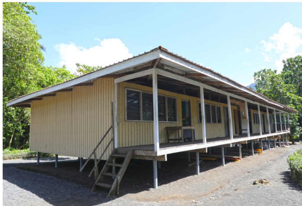
Tirongo Adventist Primary School classroom building complex funded by CDF in partnership with community support. Finishing works on the classroom is yet to be completed and is progressing.

Other sectors that SNGC continue to support include fisheries through delivery of boats & OBMs, income-generating, health and housing projects. MRD is administering the CDF Programme.