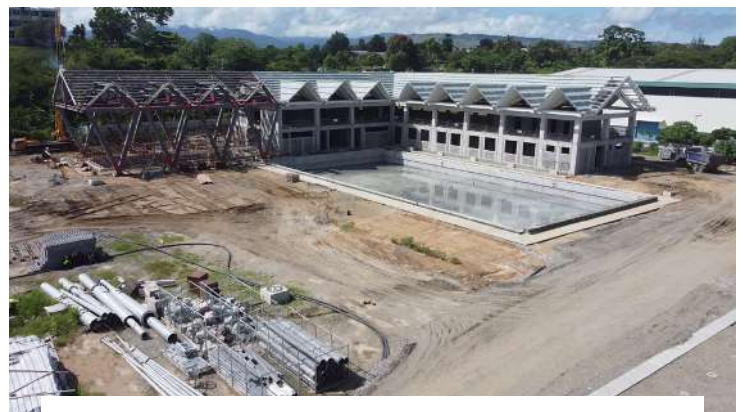
The newly constructed Games Aquatic Centre, situated inside the Games City