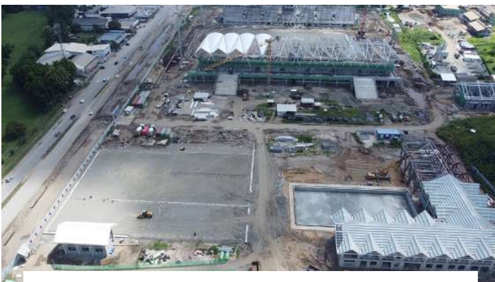
An aerial view of the Games Aquatic Centre and the Pacific Games main stadium inside the Games City