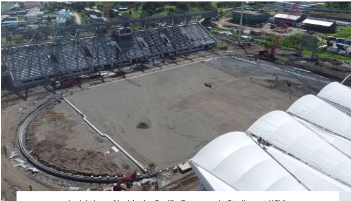
Aerial view of inside the Pacific Games main Stadium at KGV.