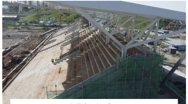
Inside the main stadium