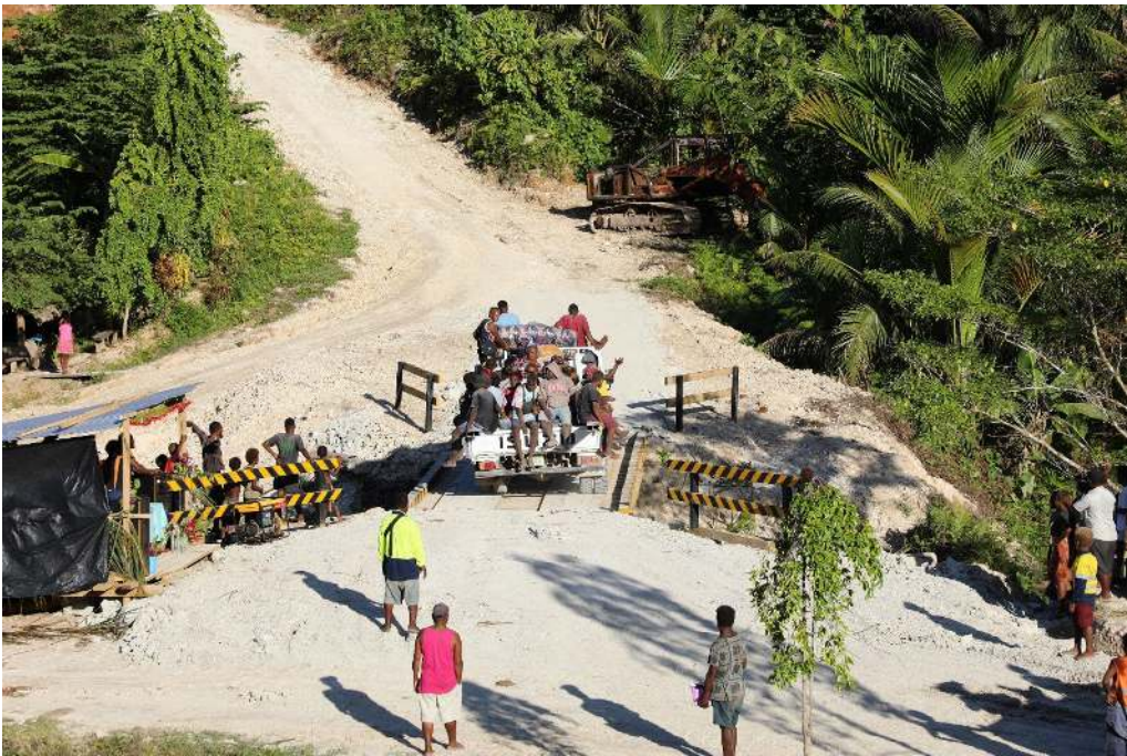
Kwaiafa bridge along East Road repaired by East Malaita Constituency Office through its CDF allocations.

Apart from the new feeder roads the East Malaita Constituency is also utilizing its CDF allocations to patch road sections from Dala in West Kwara’ae to Atori. This road is regularly used by travellers from West Kwara’ae, East Malaita, Fataleka, East Kwaio and East Are’are.