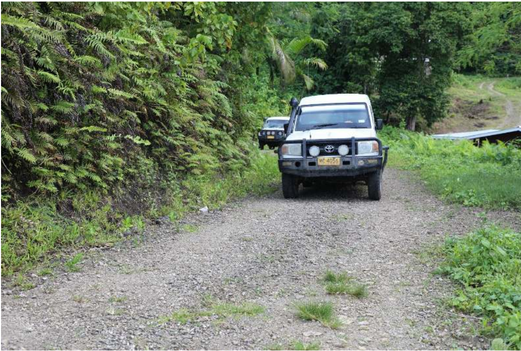
Taba’akwaru road that will be extended to reach Namoia Community High School within Kwaibaita region connecting East Kwaio Constituency.

“With these roads and the help from our government through our