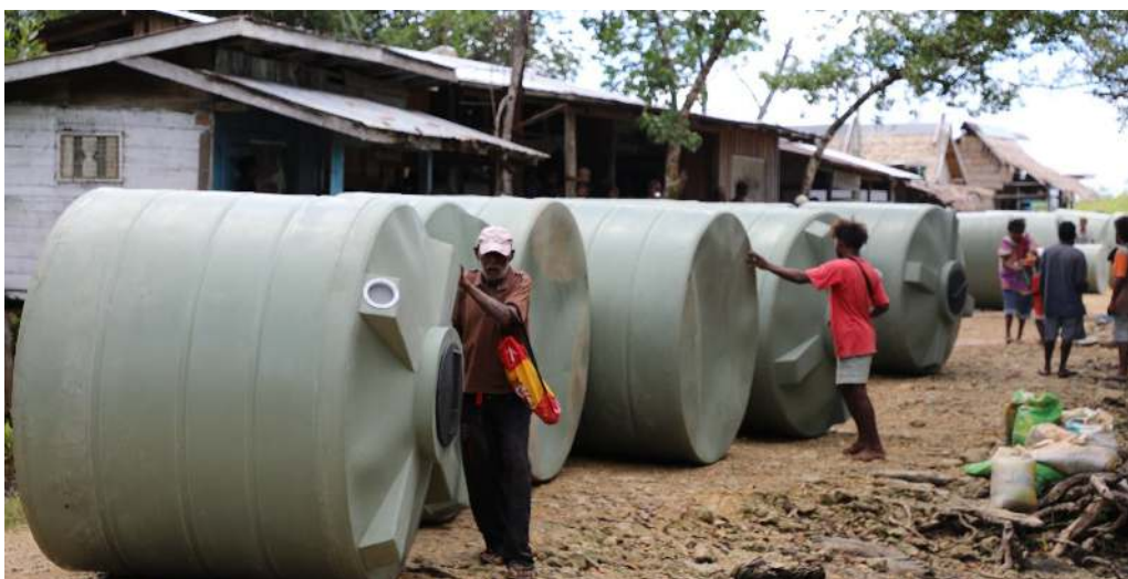
Water tanks under the WASH project delivered at Atori in East Malaita.