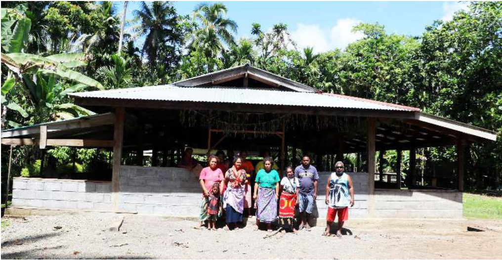
CDF funded Community Hall in one of the Community in Nukukaisi.