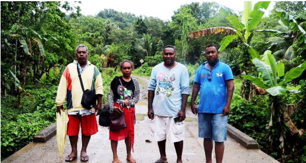
MRD M&E team arrived at the border separating Central Makira and West Makira Constituency to do project verification in Ward 9, West Bauro.