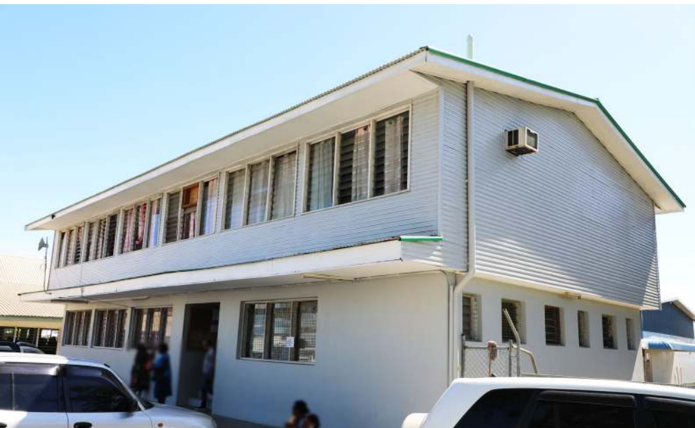
The new look of SSEC Head Office in Central Honiara after the renovation work