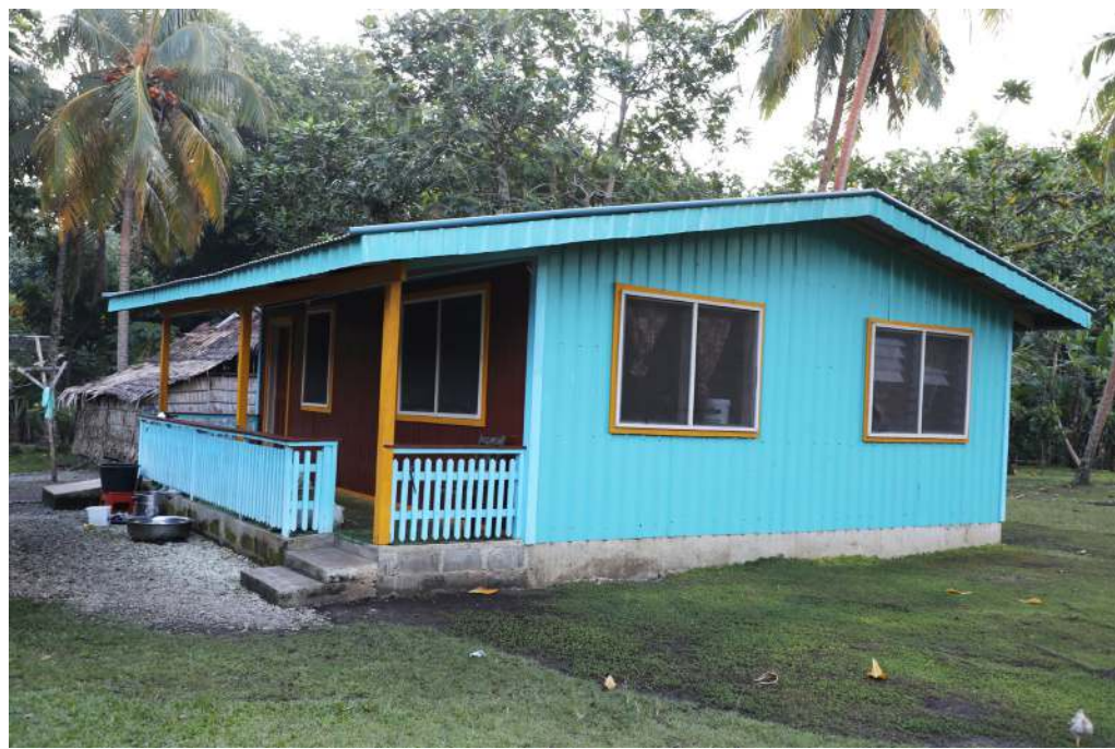
A complete CDF fully funded house at Otelo village.

“I am very happy and thankful for the government through my