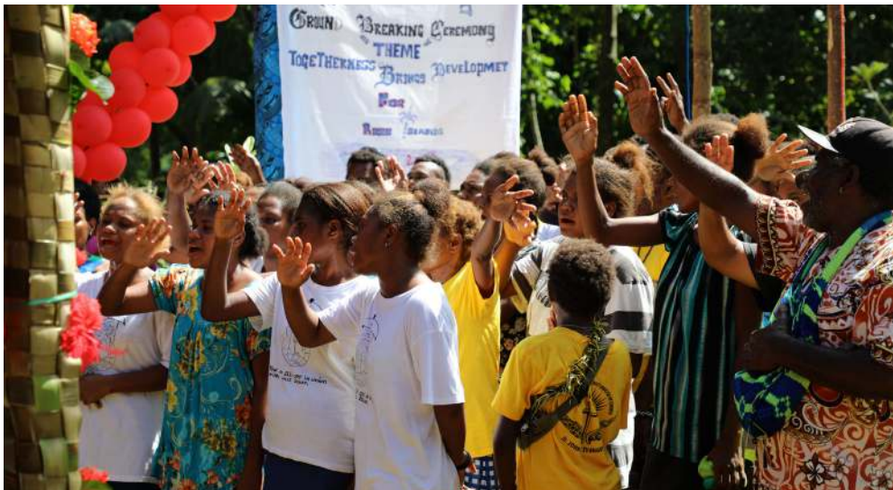
A youth group from Reef Island presents a farewell song to the government delegation.

po Area Health Center, Lomlom Airstrip, Balipa Community High School and Nyialo Fisheries Centre.