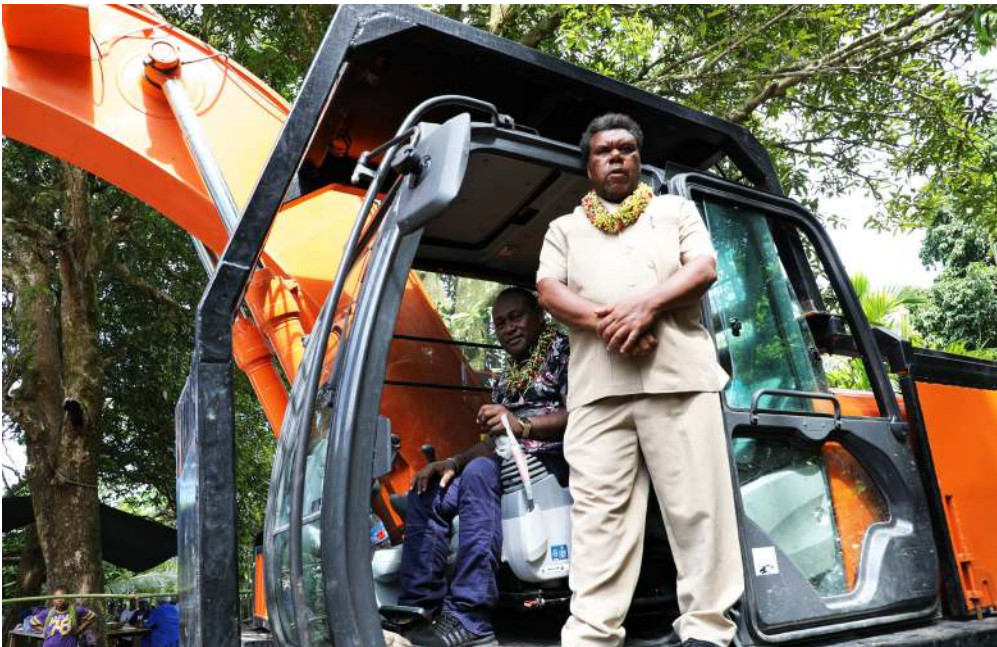
Acting PM Manasseh Maelanga and MRD Minister and MP for Temotu Pele get on one of the excavator machines during the ground breaking ceremony.