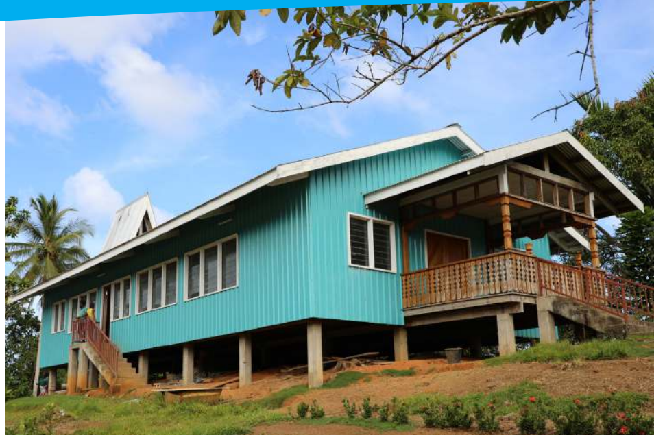
United Church building at Kio Community in East Choiseul Constituency. This CDF project is implemented through community partnership with the constituency office.