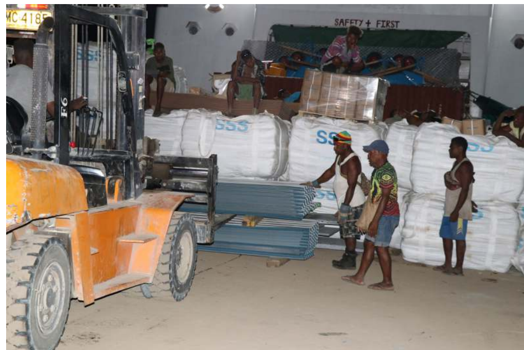
Lau/Mbaelelea constituency building materials for housing projects loaded into MV Zaraly.

Apart from having these important rural development initiatives in place at the constituency level, Lau/Mbaelelea also embarked on road development of 23 Kilometer that connects West and East Mbaelelea. Important types of machinery were also shipped to the constituency for