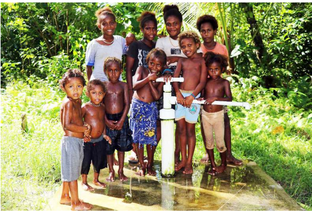
Malau Paina (Three sister island) children enjoying their fresh water hand pump funded under CDF.

“Thank you all for your welcome, time, cooperation and participation in the discussion and interviews on the implementation of the CDF Program in Central Makira constituency. Your participation and