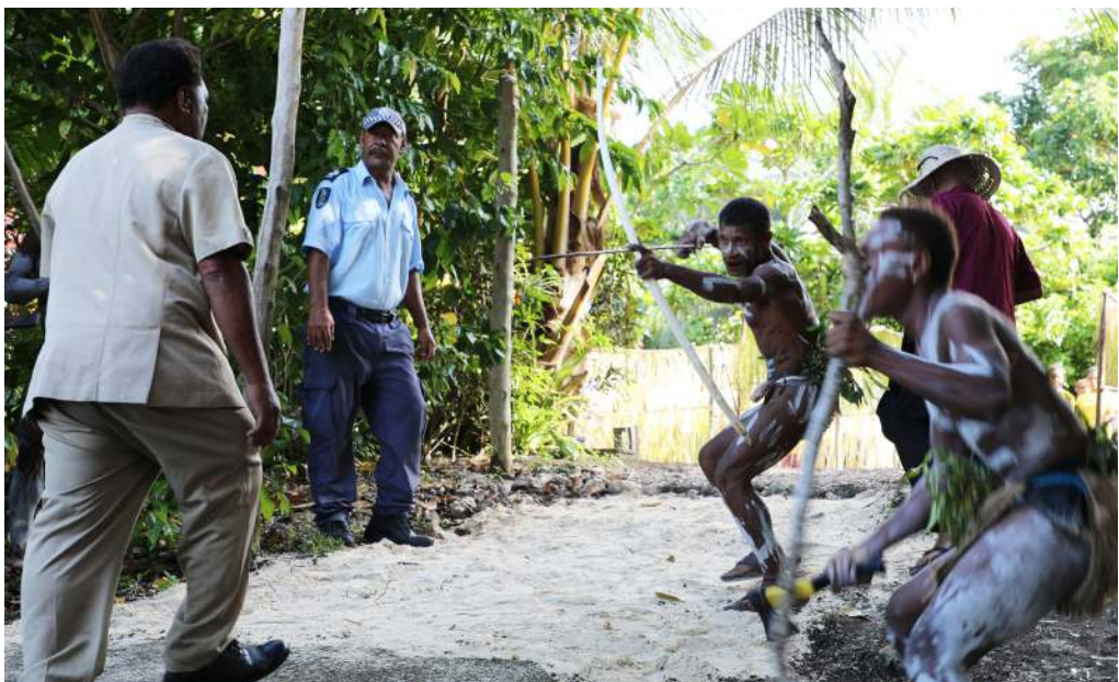
Minister Kopu and delegation welcomed by warriors at Nyialo village.