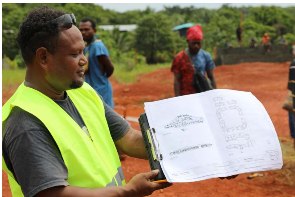
Harrison of Harly Designs Consultancy Ltd showing the architectural design of the mini-hospital project.

Harly Designs Consultancy Ltd is building the hospital with support from communities in East Malaita.