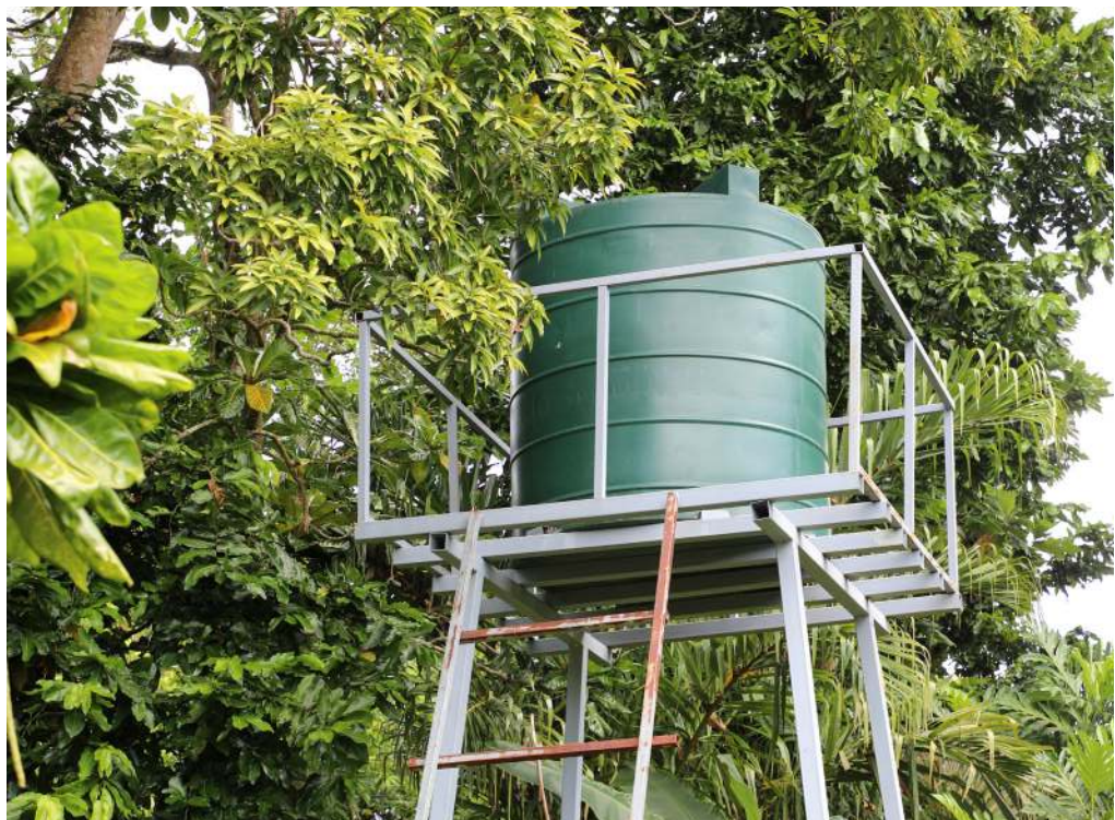
One of the 5000 litre feeder gravity tanks that supply to communities. The project is fully funded by CDF.

Honourable Duddley Kopu who is the Minister for MRD is the current Member of Parliament for Temotu Pele Constituency. He was elected to the national parliament after he successfully contested and won TPC seat on 19th November, 2014 in a national by-election. ■