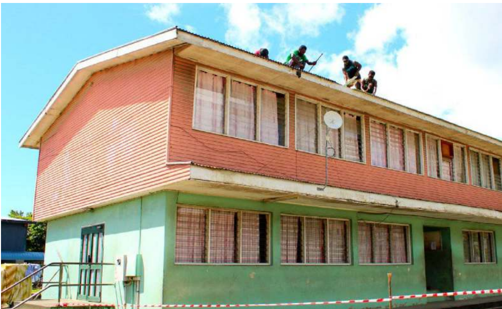
Previous look of the SSEC head office. On top the building are Carpentry workers doing replacement of the roof.

The South Seas Evangelical Church (SSEC) in Central Honiara got a facelift after the Central Honiara Constituency (CHC) office supported the much-needed maintenance and renovation work to its ‘Head Office’ building in August, 2022.