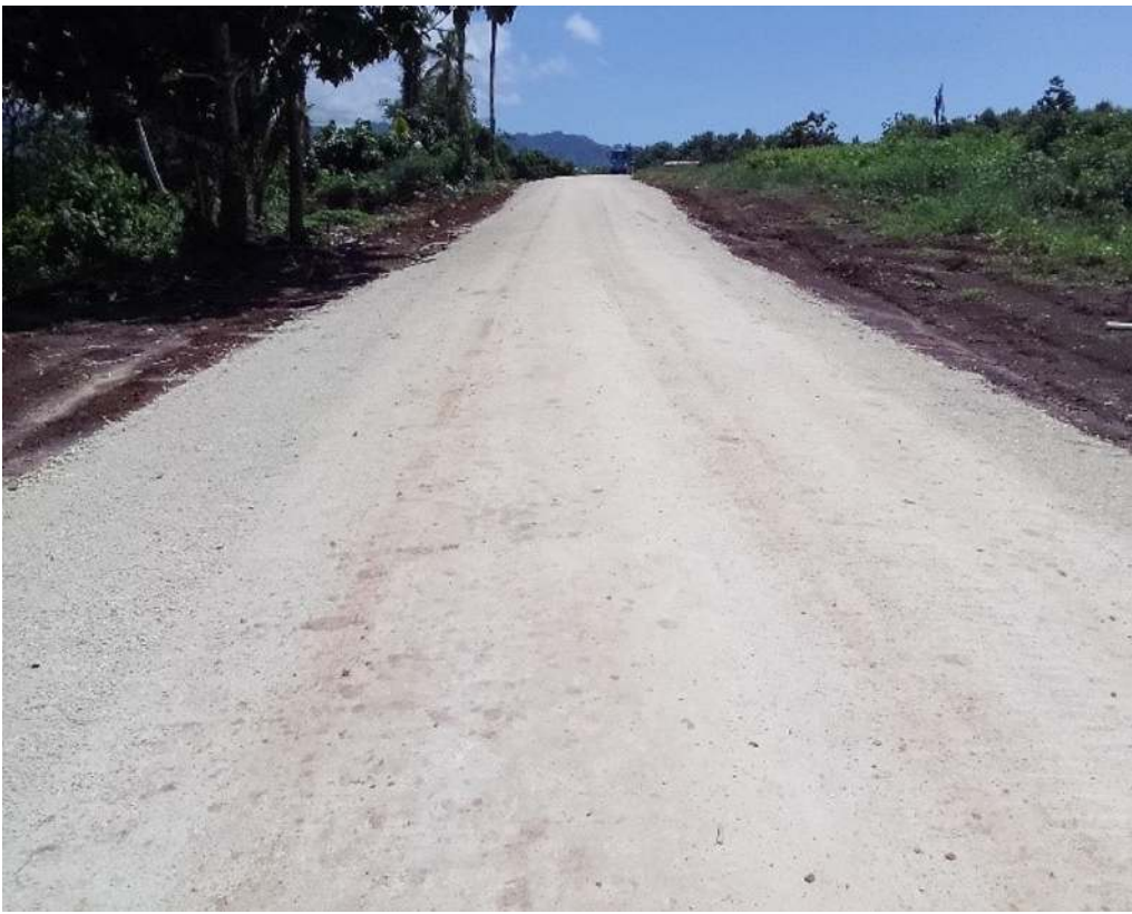
A stretch of road that leads up to Ata’a head road.

The project is funded by the CDF programme of the national government through the Fataleka Constituency Office.