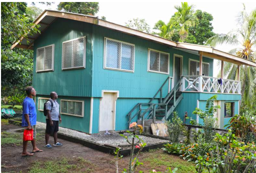
Permanent Secretary of MRD Dr. Samson Viulu and a constituent check on one of the houses fully funded by CDF at Nyialo village.

The Constituency Development Fund (CDF) programme of the national government administered by the Ministry of Rural Development (MRD) is continuing to transform living standards in Temotu Pele Constituency in Temotu as constituents benefit from the CDF by owning permanent dwelling homes.