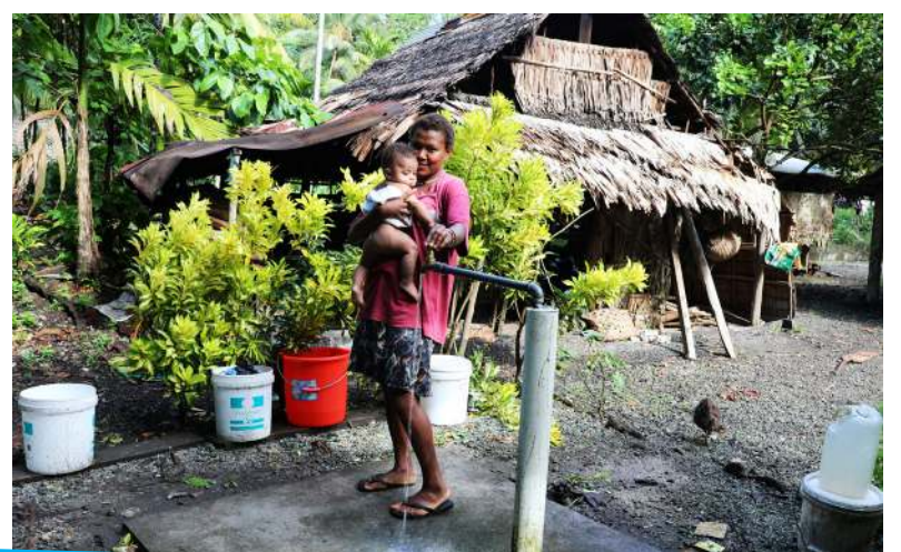
Water project in Temotu Pele Constituency funded by CDF.