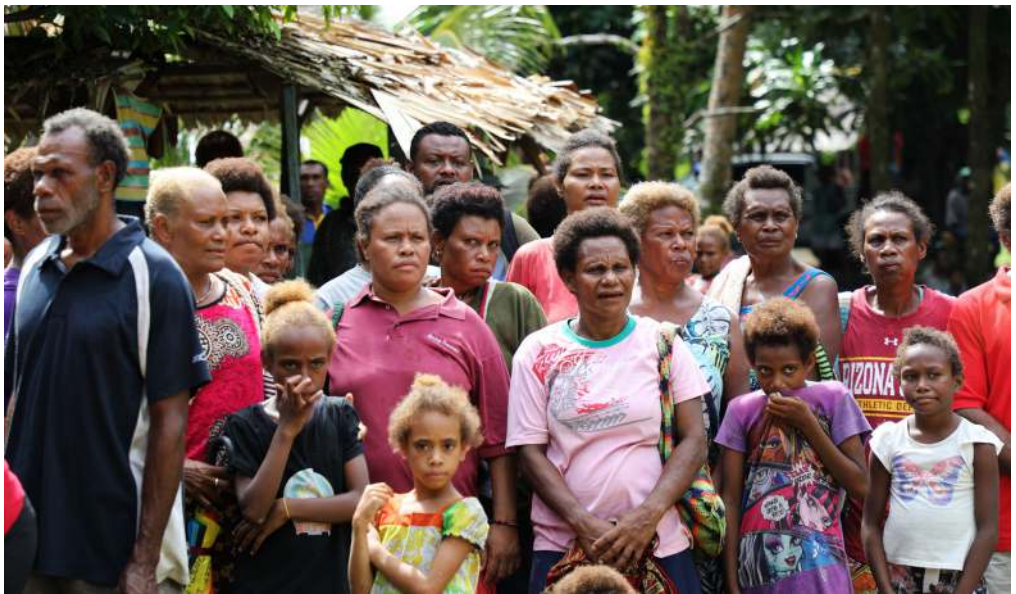
Constituents who attened the event.