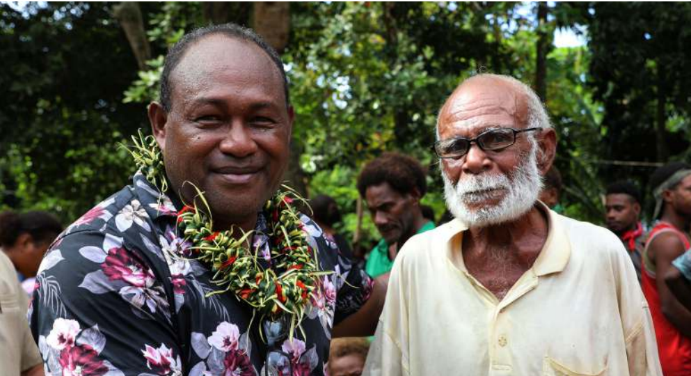
DPM Manasseh Maelanga and a community leader.