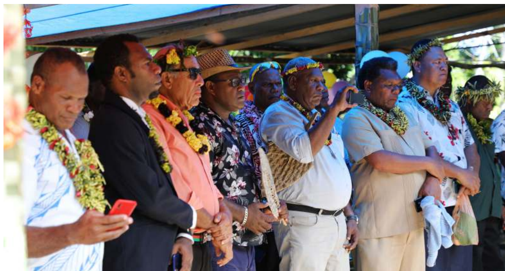
Temotu Provincial members and national government officials.