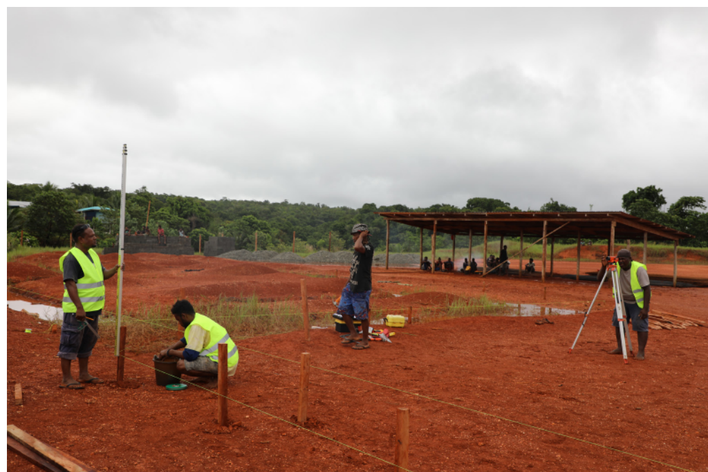
Profiling and pegging work on the mini-hospital project.