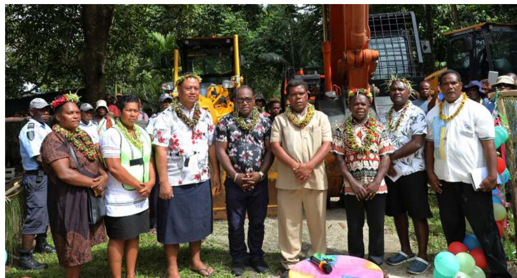
DPM Manasseh Maelanga, government officials and invited guest.