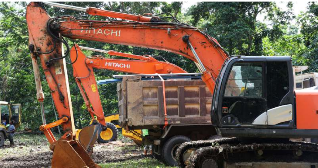
AJ company machineries for the road work.