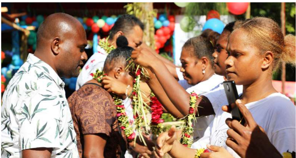
Garlanding of official guest.