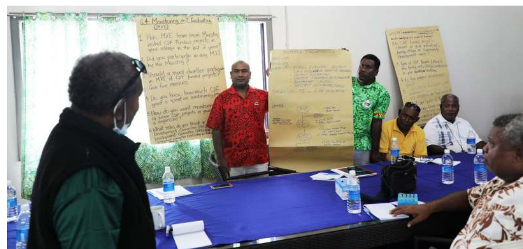
A group presenting their views and recommendations on the SICD policy.