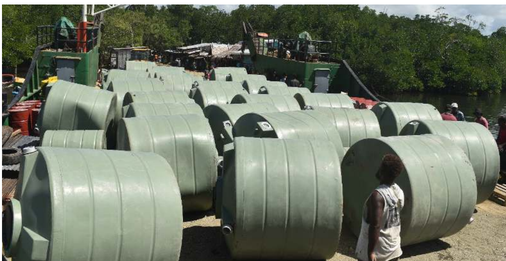
Water tanks under the WASH project upon arrival at Atori on MV Zaraly.

He said CDF is the only programme that touches ordinary lives and many constituents are directly benefiting from it.