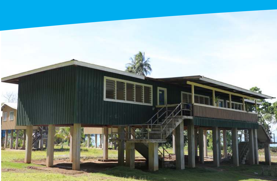
A permanent classroom at Soranamola community high school in East Choiseul Constituency. This CDF project is implemented by Soranamola in partnership with the constituency office.