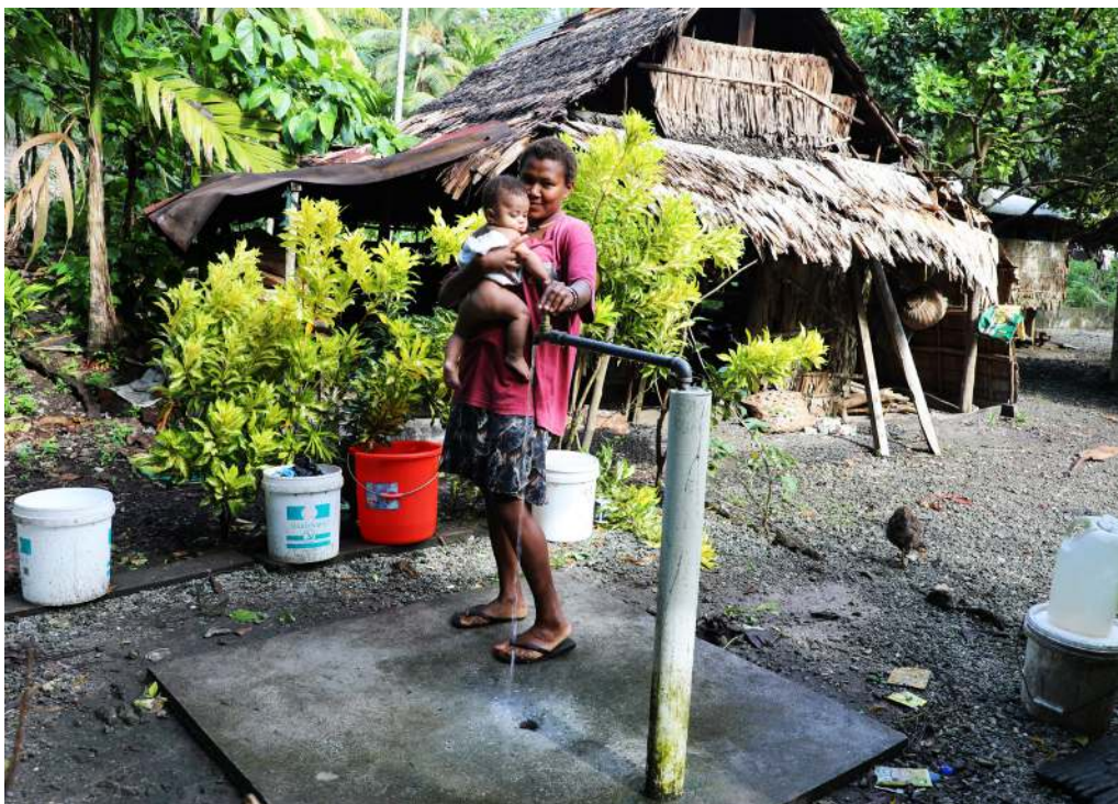
A happy constituency's now access fresh water at her home at Nopali village, Reef Islands in Temotu Province. This is fully funded by CDF.

Mr. Kuligi then acknowledged government for the CDF programme