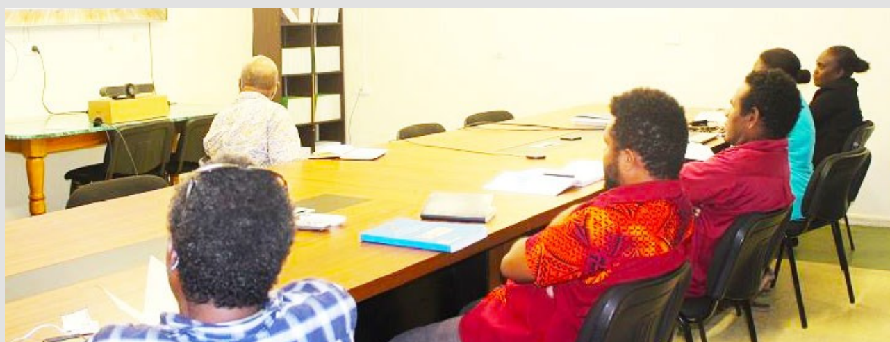
NSO Staff begin their analysis on the 2019 Census.

NSO will launch the final results of the survey anytime this year and they are expected to be slightly different compared to the provisional results.