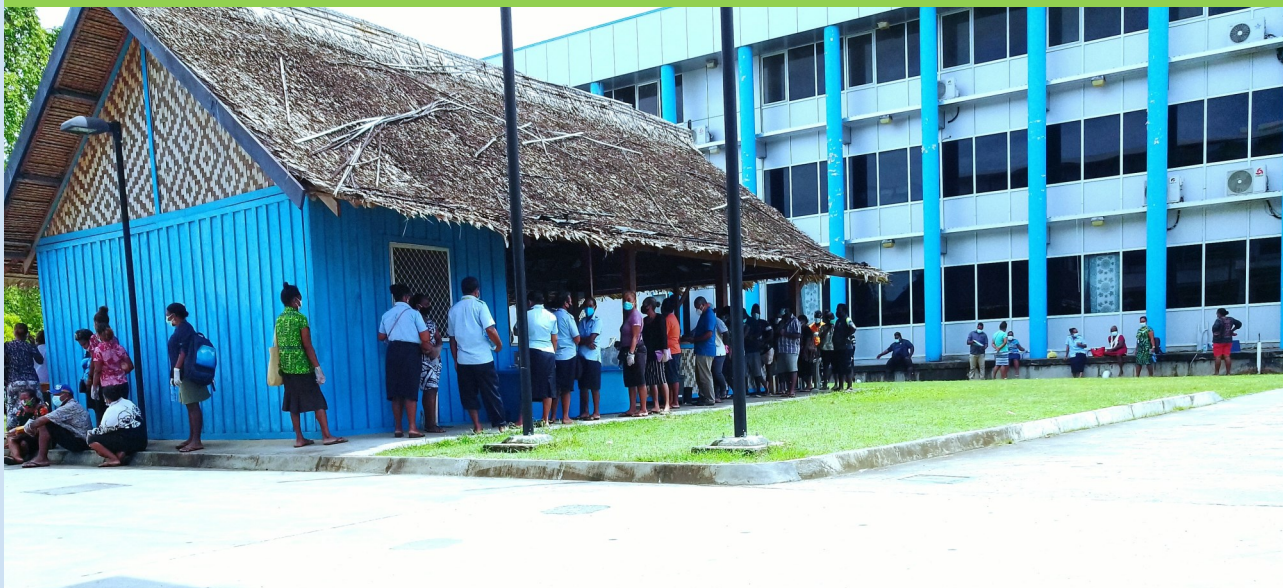
The first swabbing exercise conducted at the Finance headquarters for all its departments in January 2022.

Nine staff from the National Statistics Office were initially positive with the COVID-19 corona virus after swabbing tests were conducted on January 2022.