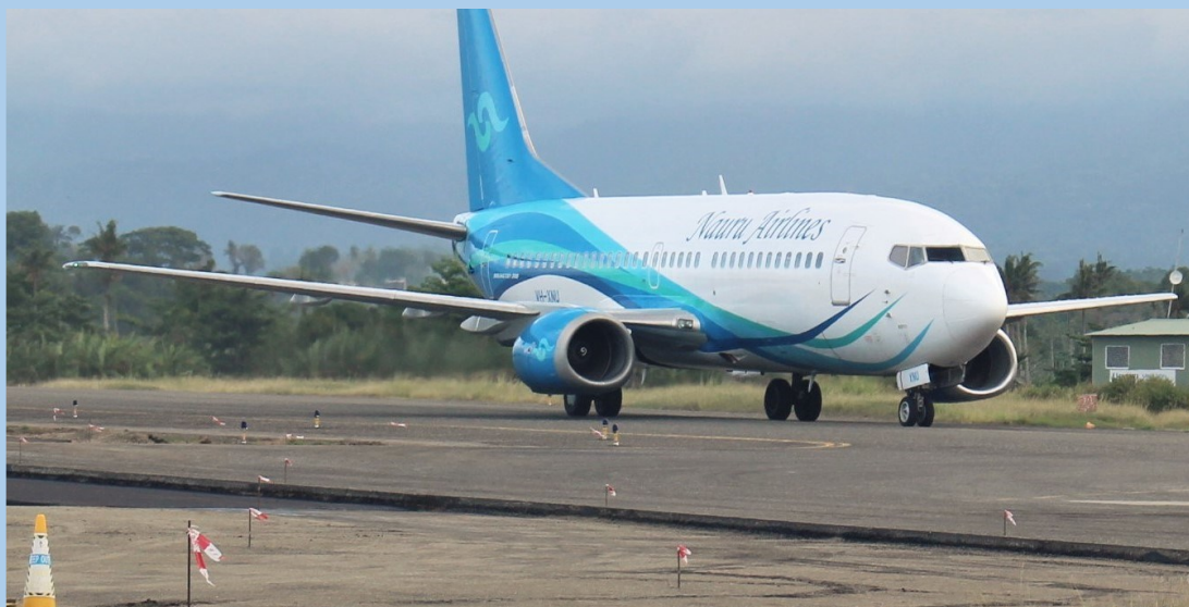
A flight from Nauru arriving at the Honiara International airport.

The National Statistics Office has released the final International Arrivals bulletin for 2021, which saw an increase of visitors to Solomon Islands in quarter four compared to the previous quarter, overshadowed by a declining trend since March 2020 as a consequence of the SOPE restrictions on travel.