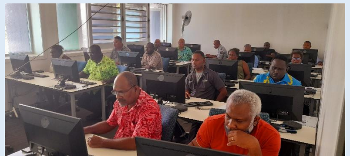
Picture 3: Group 4 D365 Procurement Approvers Training Session on 4 th August 2022 at ICTS Computer Lab.

This year 2022, the rollout activities began towards end of April 2022 and to date, 23 Ministries are now live with D365.