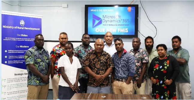
Picture 1: Change Management session with Senior Management of Ministry of Rural Development on 27 th July 2022.

This is an awareness session introducing D365, the new chart of accounts and the rollout plan of the Procurement and Expense management module, to Senior Management in each Ministry. This is a session where we also identify key personnel's who will attend the D365 trainings and later be users of D365.