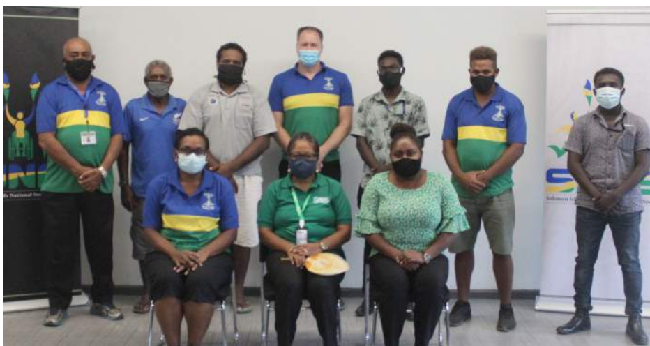
The SITAS interim committee.

"We aim to create a strong membership base of tertiary institutions and ensure that we have strong communication and links with the committee and members. We will be conducting a range of programs including the sport cluster days aligned to