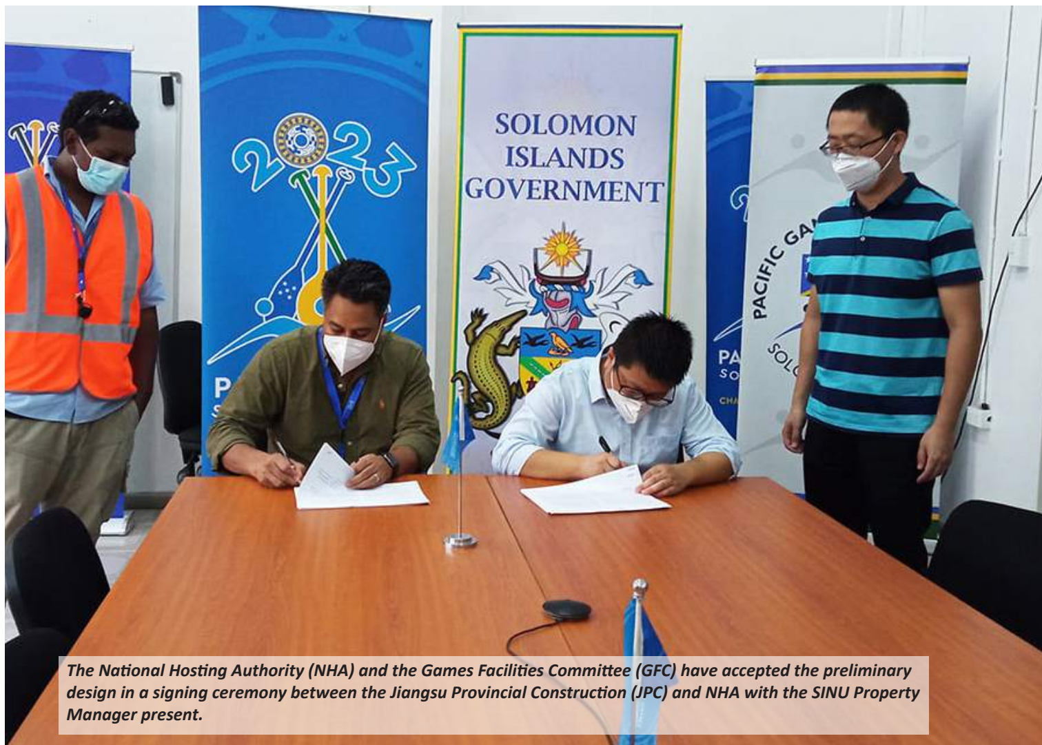
The National Hosting Authority (NHA) and the Games Facilities Committee (GFC) have accepted the preliminary design in a signing ceremony between the Jiangsu Provincial Construction (JPC) and NHA with the SINU Property Manager present.

T he Government of the People's Republic of China (PRC) and Solomon Islands Government (SIG) signed the implementation agreement in September 2021. This is for PRC to fund a 216 room Games Village for the 2023 Pacific Games and will be gifted to SINU as its dormitory to accommodate the university students.