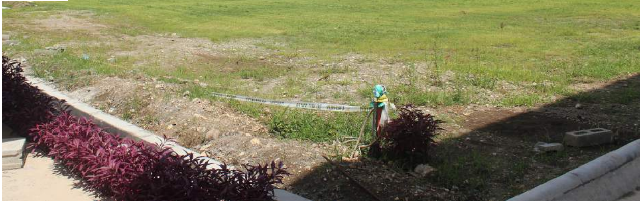
ABOVE & BELOW.....HILT construction works on the SINIS multi outdoor field is progressing well on schedule.

Solomon Islands National Institute of Sport (SINIS) High – Performance multipurpose outdoor field upgrading and construction is progressing well.