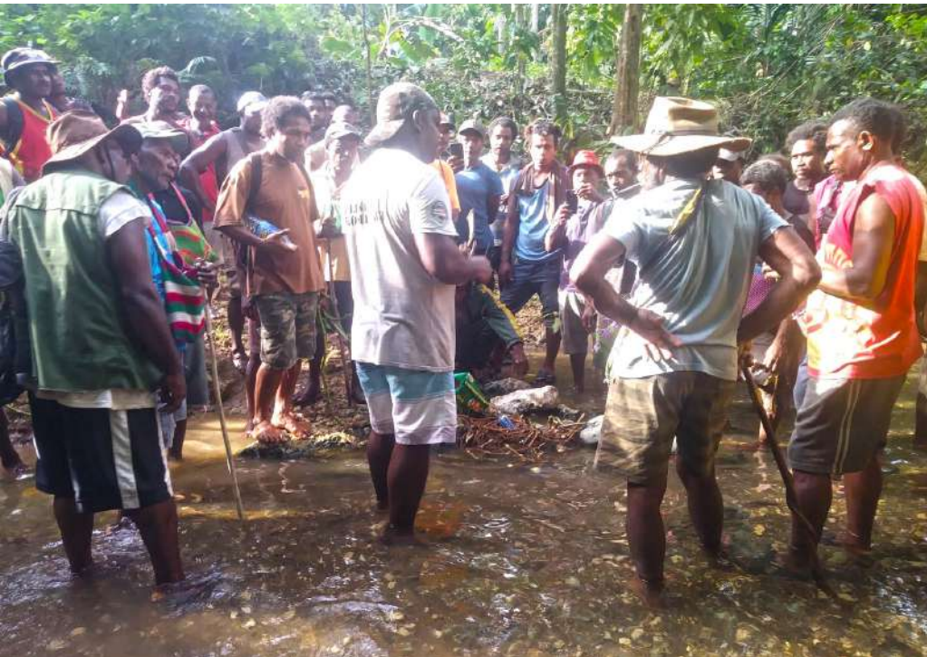
MAL officers go through kava washing demonstration with farmers. Picture below are Kava dried chips.