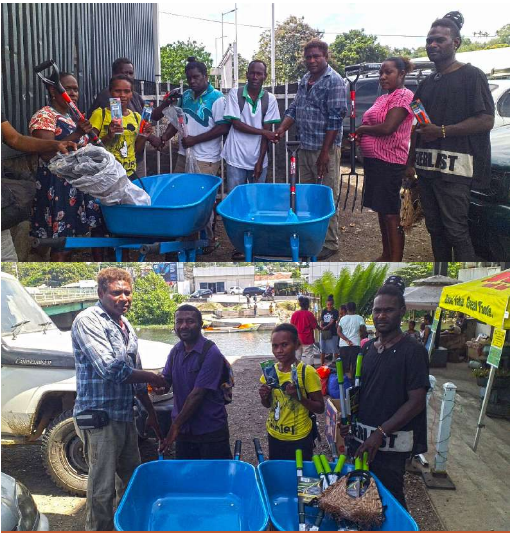
Above are pictures of the delivery.

The distribution was part of MAL's continuous support under its Export Crop programme 2021, a Medium Term Development Programme (MTDP) of the ministry which is being implemented until 2024 to boost farmer's agricultural productivity and to improve their revenue earnings. Farmers from other provinces also received similar support under the programme. The main objectives of the Programme is to; • Make sure farmers, associations, producers, buyers and exporters are empowered to increase productivity and to increase revenue earnings. • Enhanced copra productivity through rehabilitation and support to CRB activities • Enhance Cocoa Productivity through Rehabilitation and Genetic improvements • Support Kava developments to increase productivity in all the Provinces