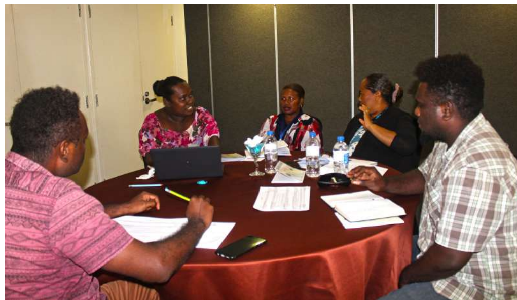
Some of the members during group discussion as they review the Honiara lockdown plan.