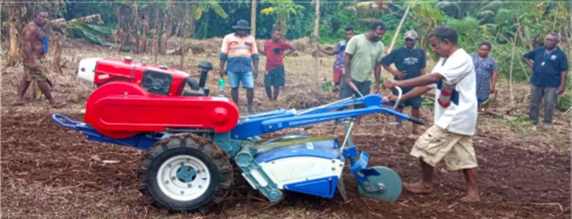
Field demonstration after the official handing over of the machines at Maepua Model farm site.

The Ministry of Agriculture and Livestock (MAL) through its Makira-Ulawa Province Extension office has boosted Maepua model farm in Central Makira with the delivery of new agricultural machines.