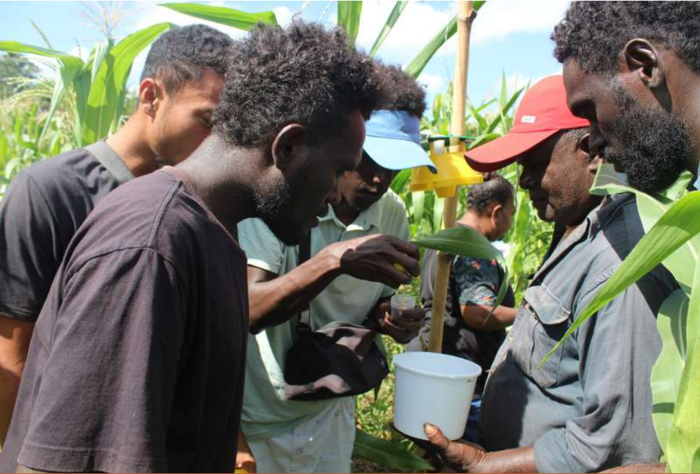
Students take a closer look at pest specimens confined in an established trap with the assistance of a Biosecurity staff.