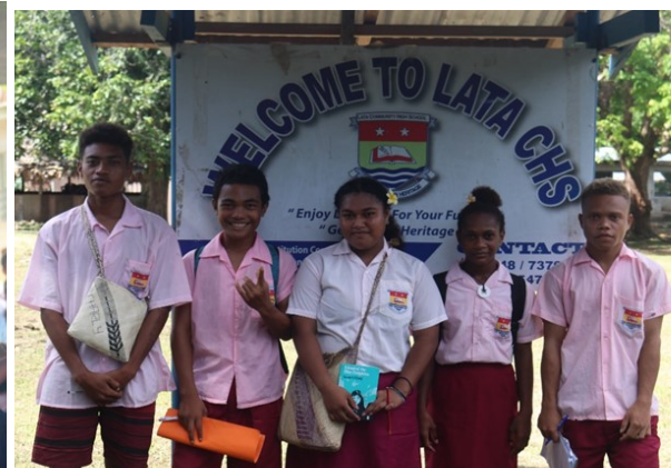
Form 3 student at Lata Community High school