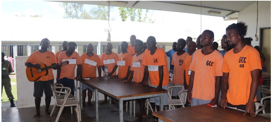
Gizo inmates putting on their beautiful song after their skid presentation