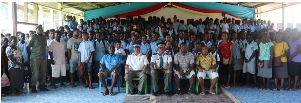
Gizo CHS staffs and students pose for a photo shot with CSSI Commissioner Gabriel Manelusi after his courtesy visit to Gizo CHS