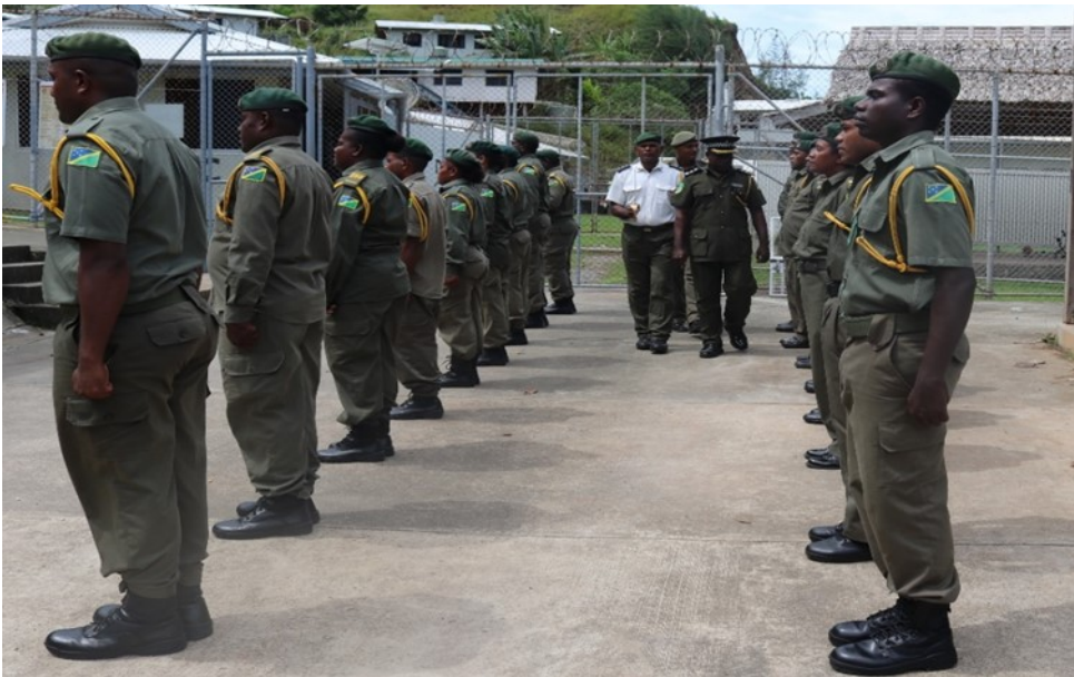
Deputy Commissioner Operation inspect the parade during his official visit to Gizo

THE Deputy Commissioner Operation of the Correctional Service Solomon Islands (CSSI) recently made a visit to the Gizo Correctional Centre