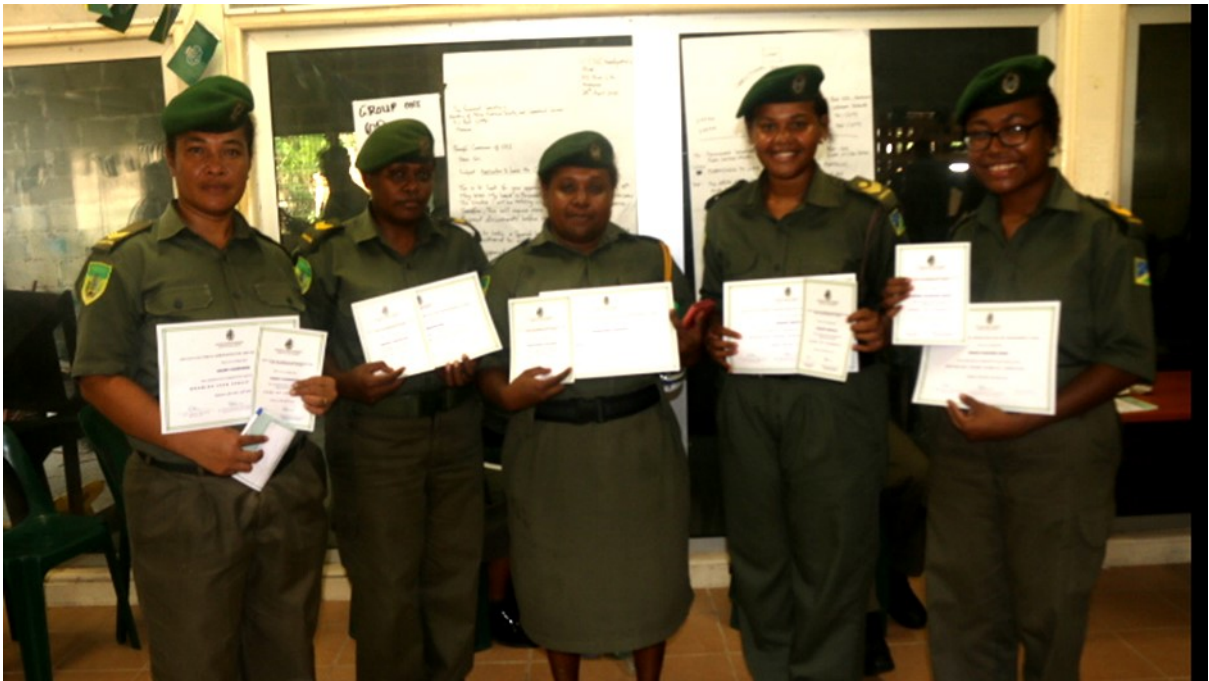
CSSI Female officers smiling with their IPAM Certificate after the Graduation ceremony

“Training helps sharpen your knowledge and skills you already have” He said