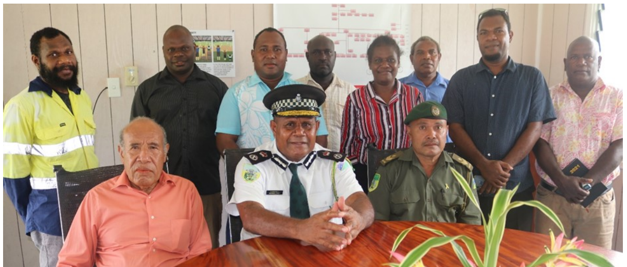
Temotu Provincial Government pose for a photo shot with Commissioner Gabriel Manelusi

During the visit, he was also able to discuss capacity and capability development plan – restructuring and succession plan, Rehabilitation and Reintegration, the Government policy redirection policy, Infrastructure future discussion to develop plan for the next 10 -30 years includes housing/office/lands and Enterprise and commercialization Development plan