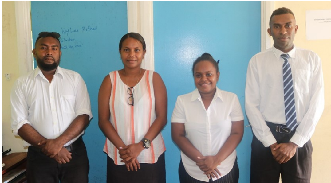
Members of the Public Solicitor Gizo, Western province

“The rehabilitation of inmates is an integral part of the work of Correctional Service Solomon Islands”,