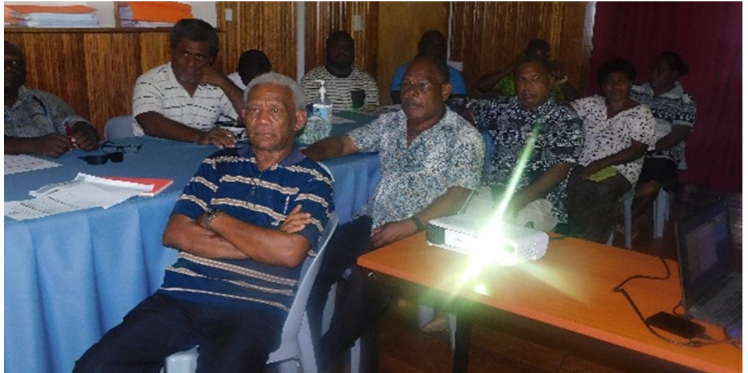
Correctional Service Solomon Islands (CSSI) Program & Industries Unit team met Prominent Faith Based Providers - Solomon Islands Christian Association (SICA) and Solomon Islands Full Gospel Association (SIFGA) to identify meaningful programs that can assist prisoner's whilst incarceration.

He said this is an initiative reintegration for inmates to attend day release classes at Don Bosco on agriculture, mechanics, and technical training in metal work.