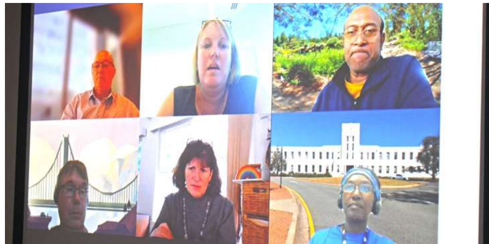
The virtual meeting between Biosecurity Solomon Islands and Australia counterparts.