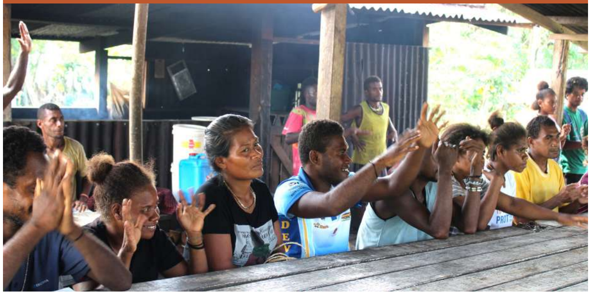
BELOW: San Isidro special needs students waves their hands as a gesture of appreciation/thank you to MAL for the generous support.