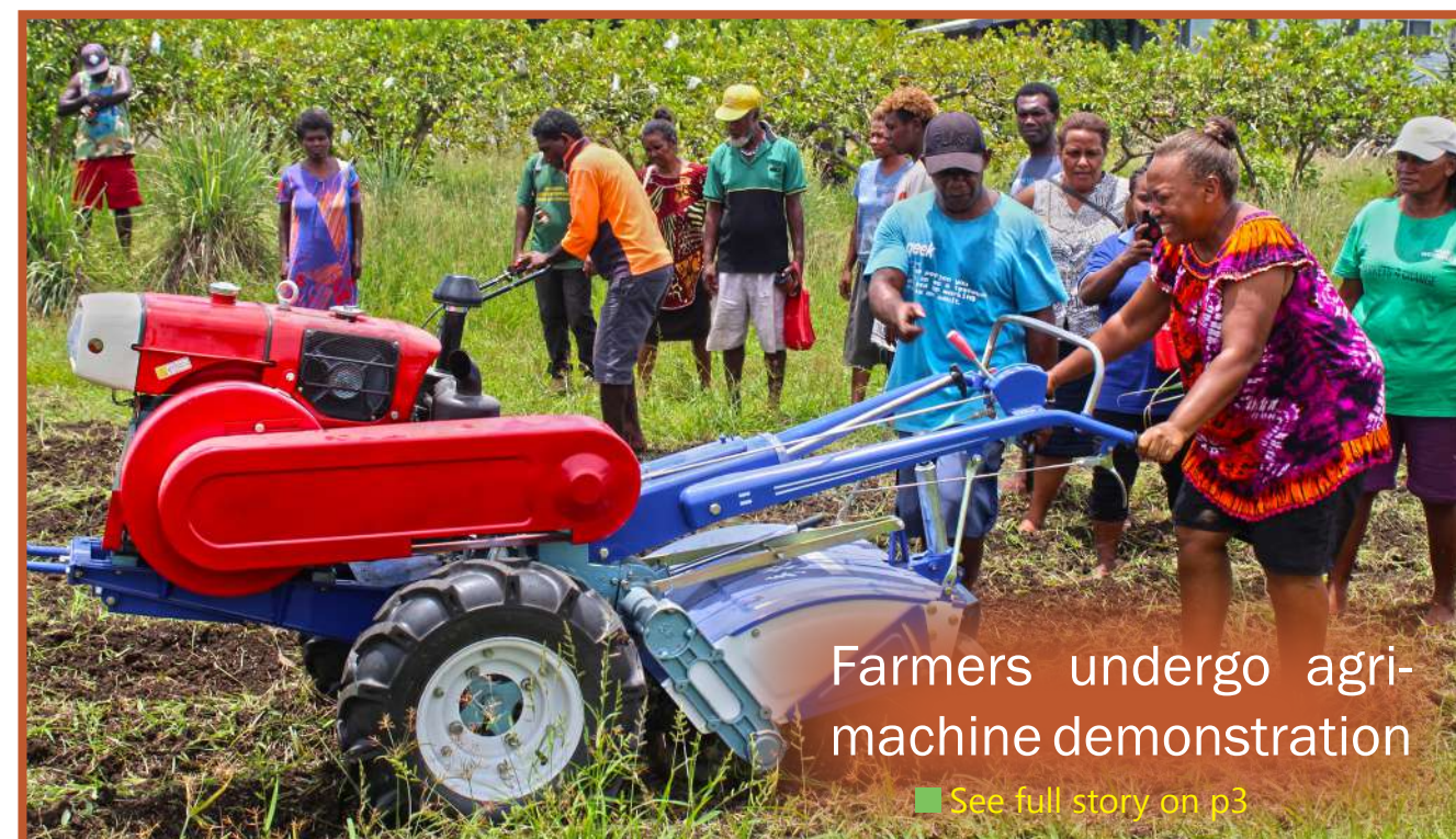
Farmers undergo agri-machine demonstration