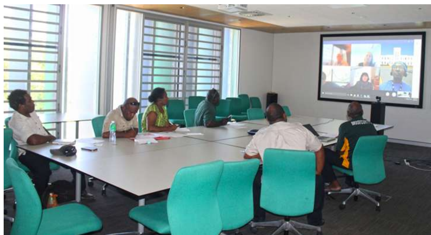
Biosecurity Solomon Islands team during the virtual meeting at the ICTSU conference room, Honiara.