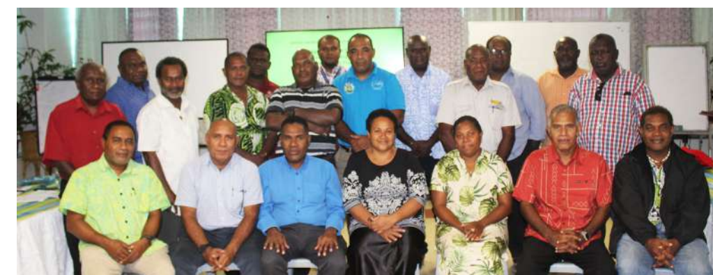
The government Permanent Secretaries and senior technical officers of the government and a rep from FAO during the consultation.

"MAL as a government agency overseeing agriculture sector only facilitate support and create conducive environment for the sector to thrive through development of policies and laws including regulations but the actual delivery is done by all who participated in agriculture activities. There are also laws hosted by other government agencies that impact on agriculture activities. Therefore, it is only meaningful that we all have a plan that sets out collective interventions to