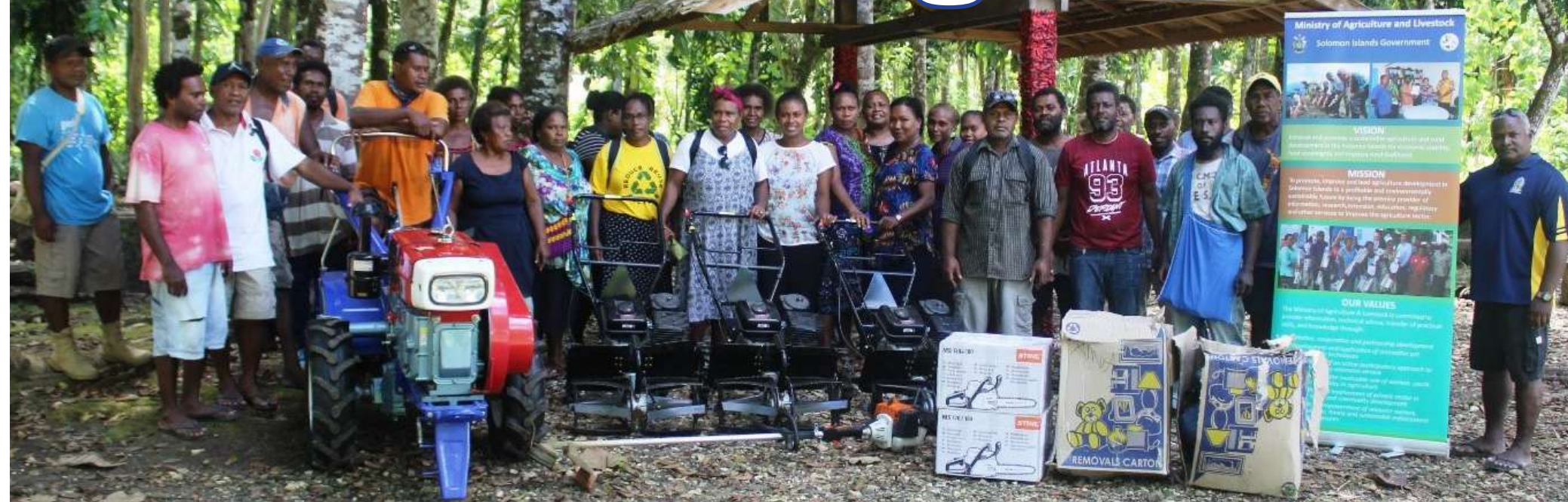
Farmer participants together with MAL officers and UNDP rep that attended the demonstration and training on Tuesday 30th March 2021.

Over thirty farmers of the Auki Market Vendors Association (AMVA) in Malaita Province has successfully completed an agricultural input demonstration and training conducted by the Ministry of Agriculture and Livestock (MAL) on 30th March 2021.