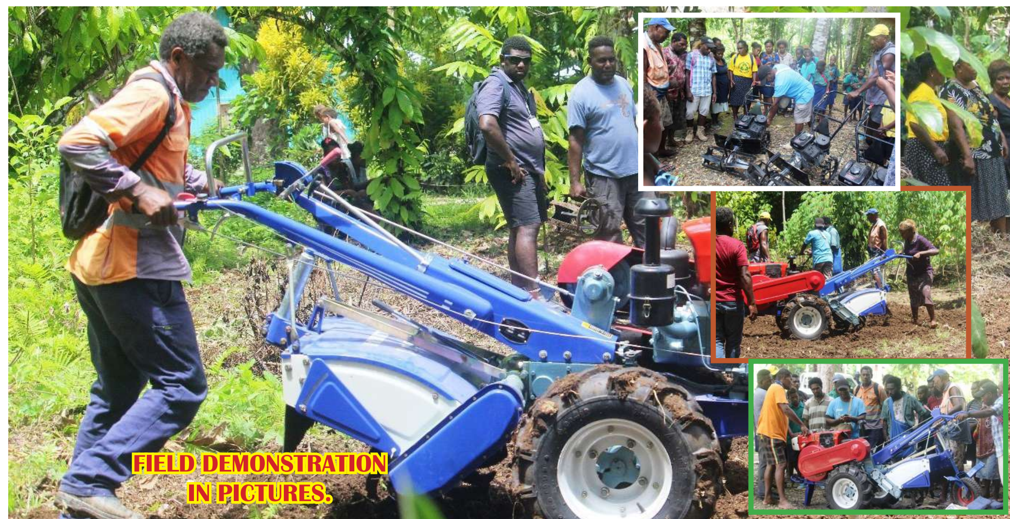
FIELD DEMONSTRATION IN PICTURES.