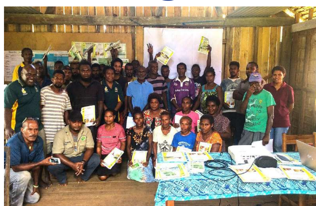
Biosecurity officers, JICA rep and Ministry of Forestry officers with community member participants during the awareness-training.

"There was an MOU signed between BSI and JICA under its (JICA) project on Capacity Development for Sustainable Forest Resources Management in Solomon Islands. The MOU is to permit BSI to carry