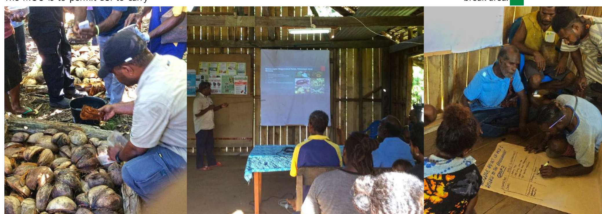
ABOVE & BELOW: Pictures of the awareness training which include presentations and field demonstration along with activities. The awareness-training was a success with the establishment of a biological control agent for GAS by their team at the village/community.

MAL through its Biosecurity department has carried out active campaigns to eradicate it but after that proved impossible, to reduce its impact and contain it to the outbreak area.