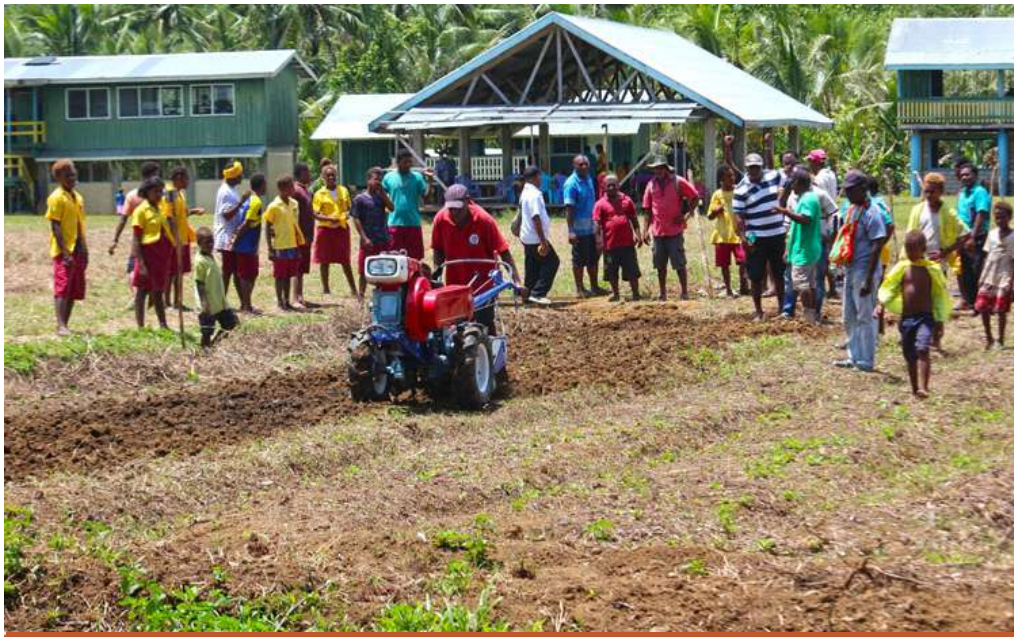
Field demonstration. The inputs included a walking tractor power tiller procured in partnership with the UNDP Markets for Change (M4C) Project via the UN COVID-19 Response and Recovery Multi Partner Trust Fund last year.