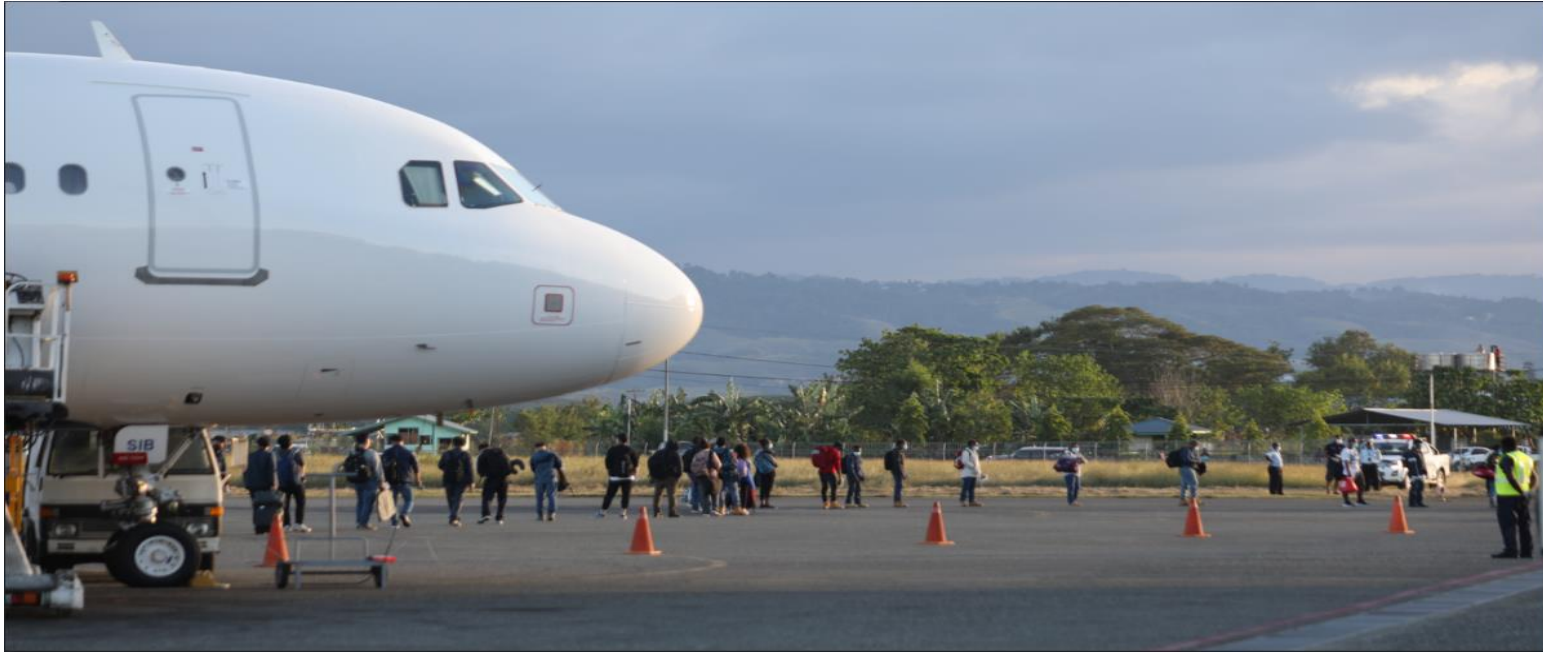
Figure 2: Passenger queuing up for temperature test while maintaining social distancing.