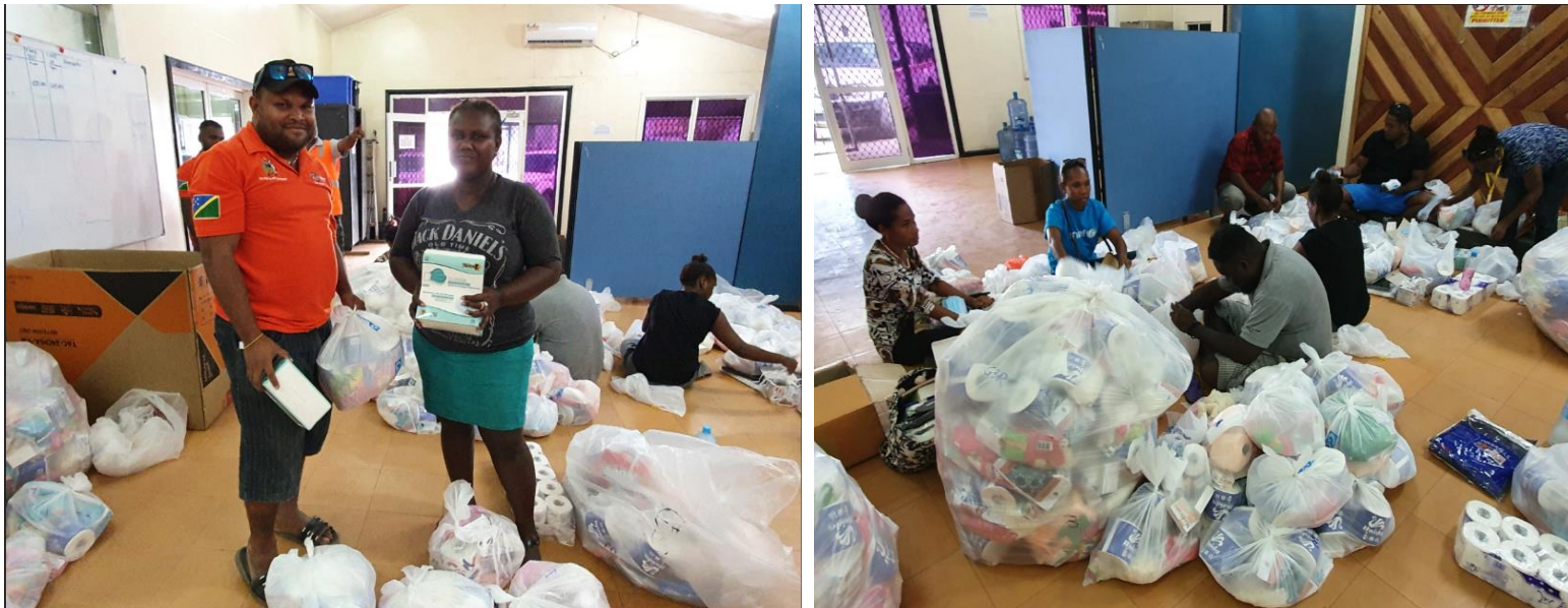
Figure 3: Camp Management Sector Committee (IQF Management Team) undergoing preparations for incoming passengers.