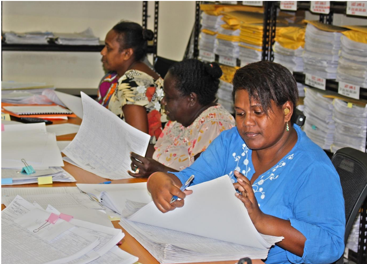
Some of the female census data quality checkers checking all the filled census forms.