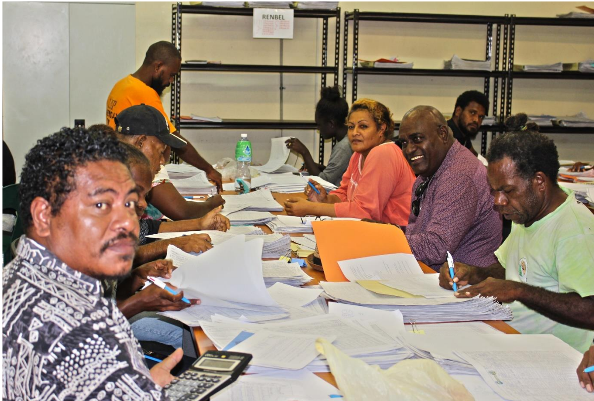
Some of the Census data quality checkers at work.