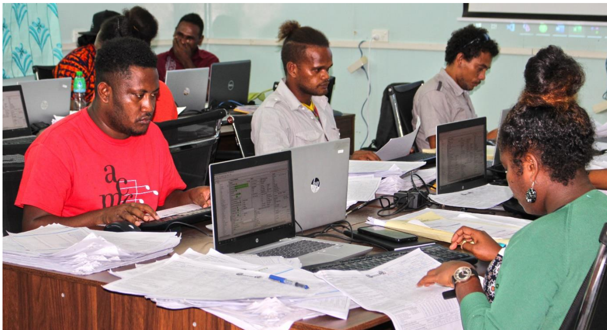
Data officers entering information/data using a special data software programme.