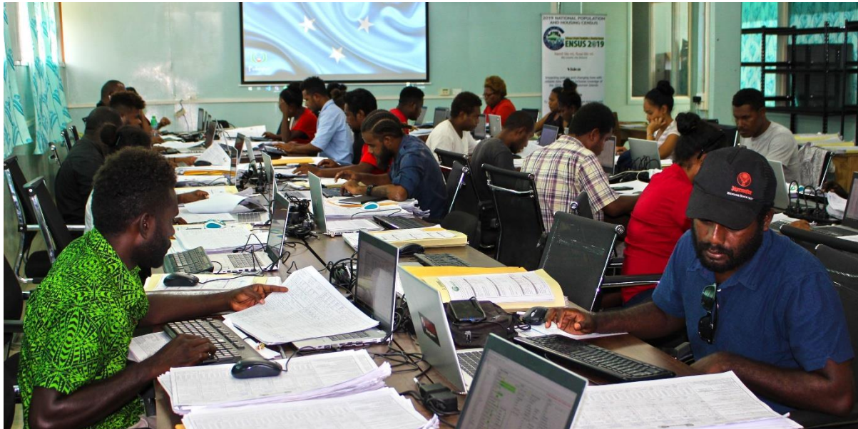
Census data entry officers at work.