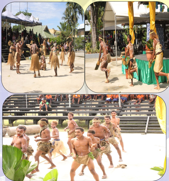
Students from USP (top pics) and Tenaru students during the Museum day, 18th May 2016

The National Auditorium is available for the public for hiring at a reasonable price rather base on the nature of the activity or event planned. It has two stages; indoor and outdoor which cater for different programs and events. The auditoriums is located within the Solomon Islands National Museum compound. These facilities are government own properties, which managed by the Ministry of Culture and Tourism through the National Museum. It was built in purposely to host a range of performing arts activities and events during the 11th Festival of Pacific Arts in Honiara. Nevertheless, the indoor stage can cater for 400 persons and the out-door stage can host huge crowd.