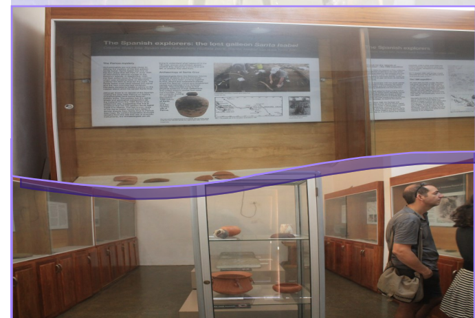
Pre-History in side features

The Pre-history exhibition briefly covers themes on the prehistoric migrations and archeological sites in Solomon Islands, early settlements, Lapita settlements and migration, and migration from Polynesia.