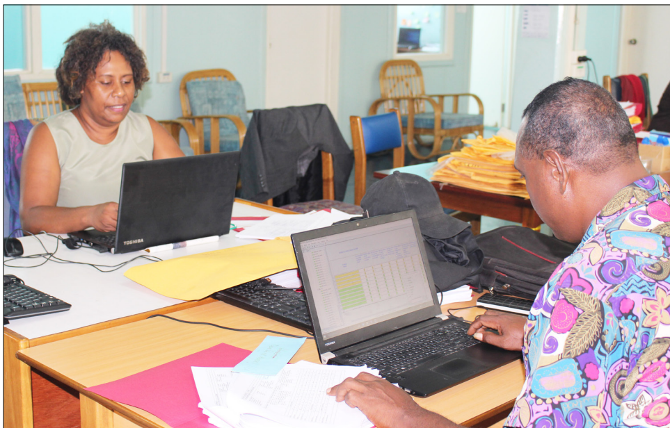
Data officers doing data entry work for the Village Resource Survey at the NSO in Honiara.