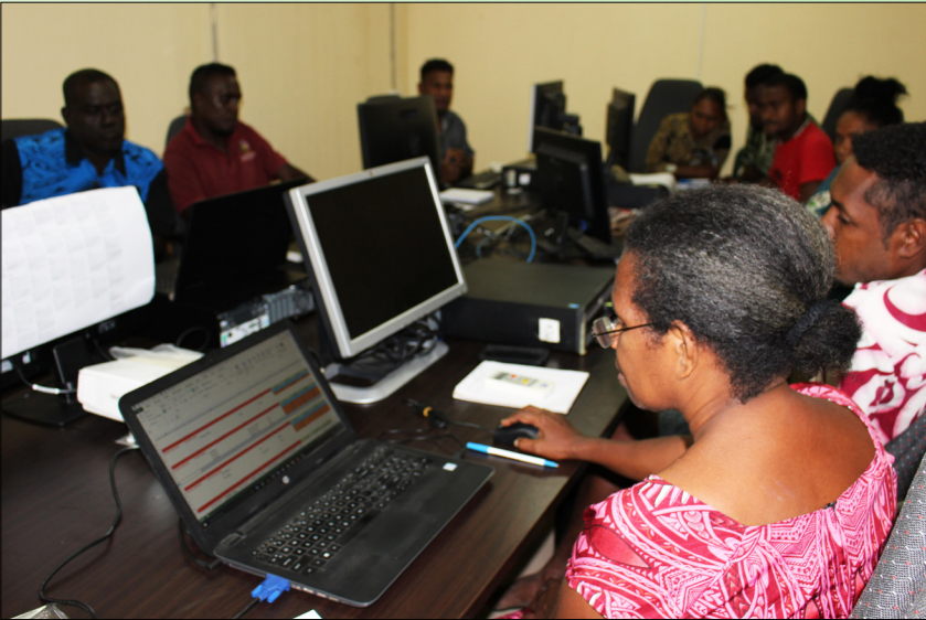
National Statistics Office staff during a training.

Our people are innovative and resourceful. They are skilled and capable of producing relevant, accurate and timely data according to internationally acceptable and professional standards.